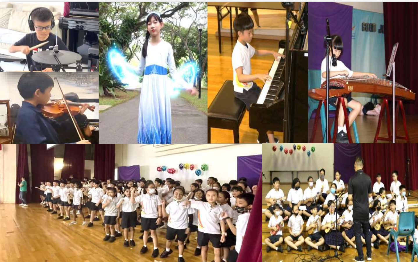
Springdalites showcasing their talents and musical skills

Our Springdalites showcased their talents through a variety of performances during the Teachers' Day concert, such as playing the piano, drum, Gu Zheng, singing and dancing.