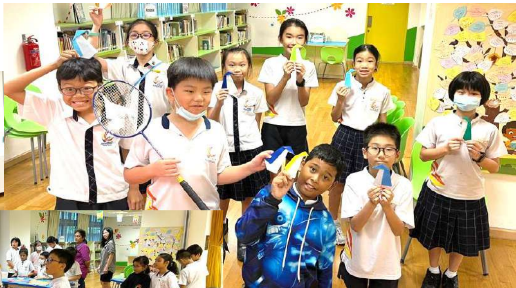
Proud Springdalites with their origami