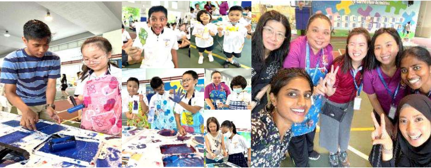
Springdalites exploring various Art Printmaking activities with the help of Art teachers and Parent Volunteers

On 28 July, we had our Aesthetics Moments @ Recess which aimed to promote the creative expression of Springdalites. Springdalites could showcase their musical talent and also try the hands-on activities at the Art Booth.