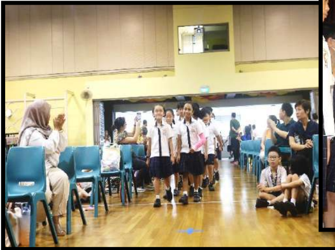
Student Leaders marching down the hall

On 30 June, the Student Leaders marched down the hall and onto the stage to stand proudly to pledge their commitment as student leaders of Springdale Primary School during the 2023 Student Leaders Investiture.