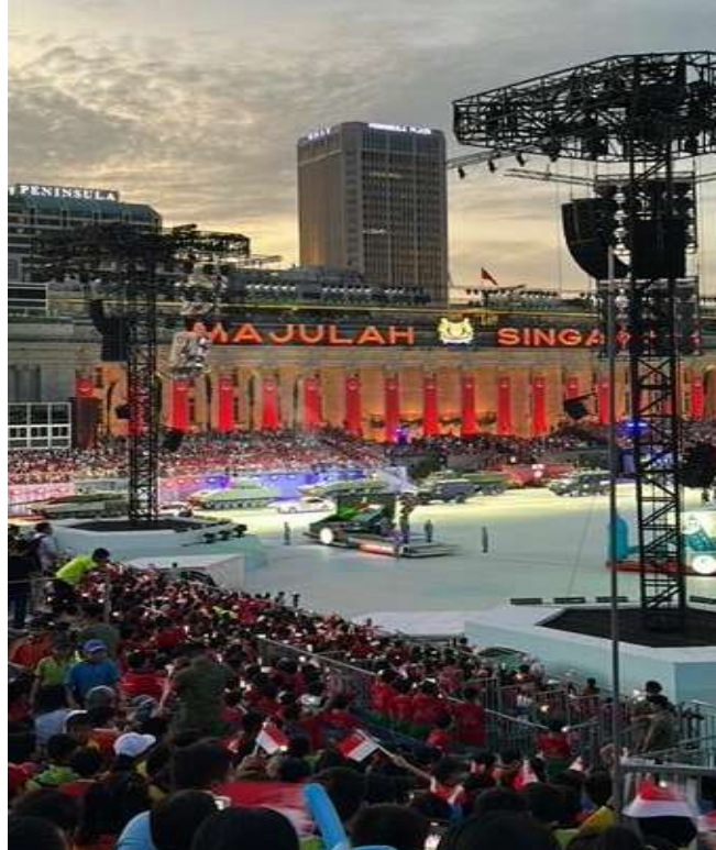
Evening view at the Padang

On 15 July, our P5 Springdalites set off to the Padang to watch the NE Show. This year's show was special for the students as they had the opportunity to experience the show at the Padang, a site of many of Singapore's shared memories as a nation.