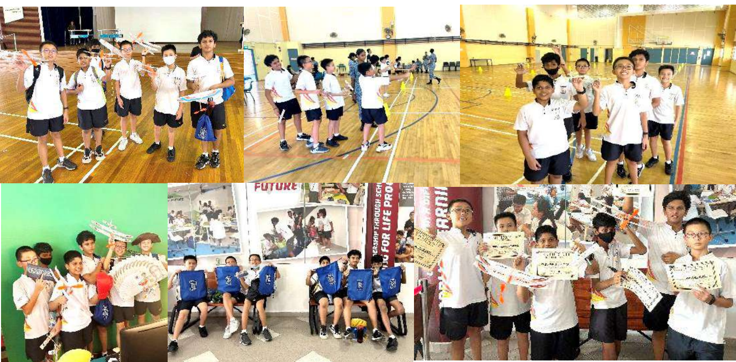
Participants of the Fly High Aviation Carnival at Changkat Changi Secondary School

During the carnival, our Springdalites had the opportunity to learn about various aspects of aviation through engaging workshops, including the various aspects of aircraft design, flight simulation and the future application of drones. They also participated in various hands-on activities, such as building and flying their own model aircraft and flying drones through obstacles.