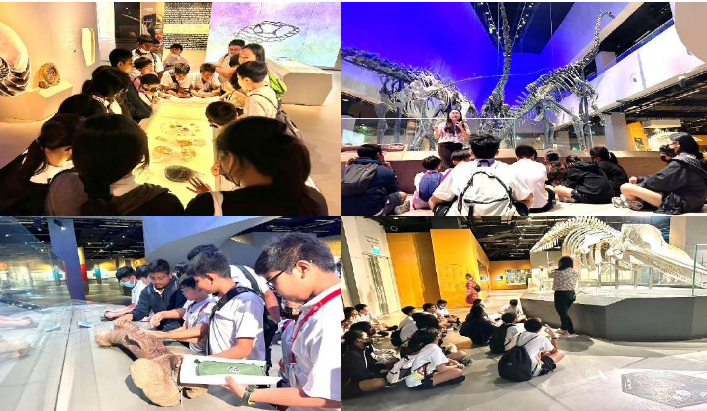
Springdalites engaged in interactive activities that illustrated the unique adaptations of organisms found in nature

Our P6 Springdalites took part in a workshop on Singapore Biodiversity and Adaptation as well as a guided gallery tour at the Lee Kong Chian Natural History Museum.