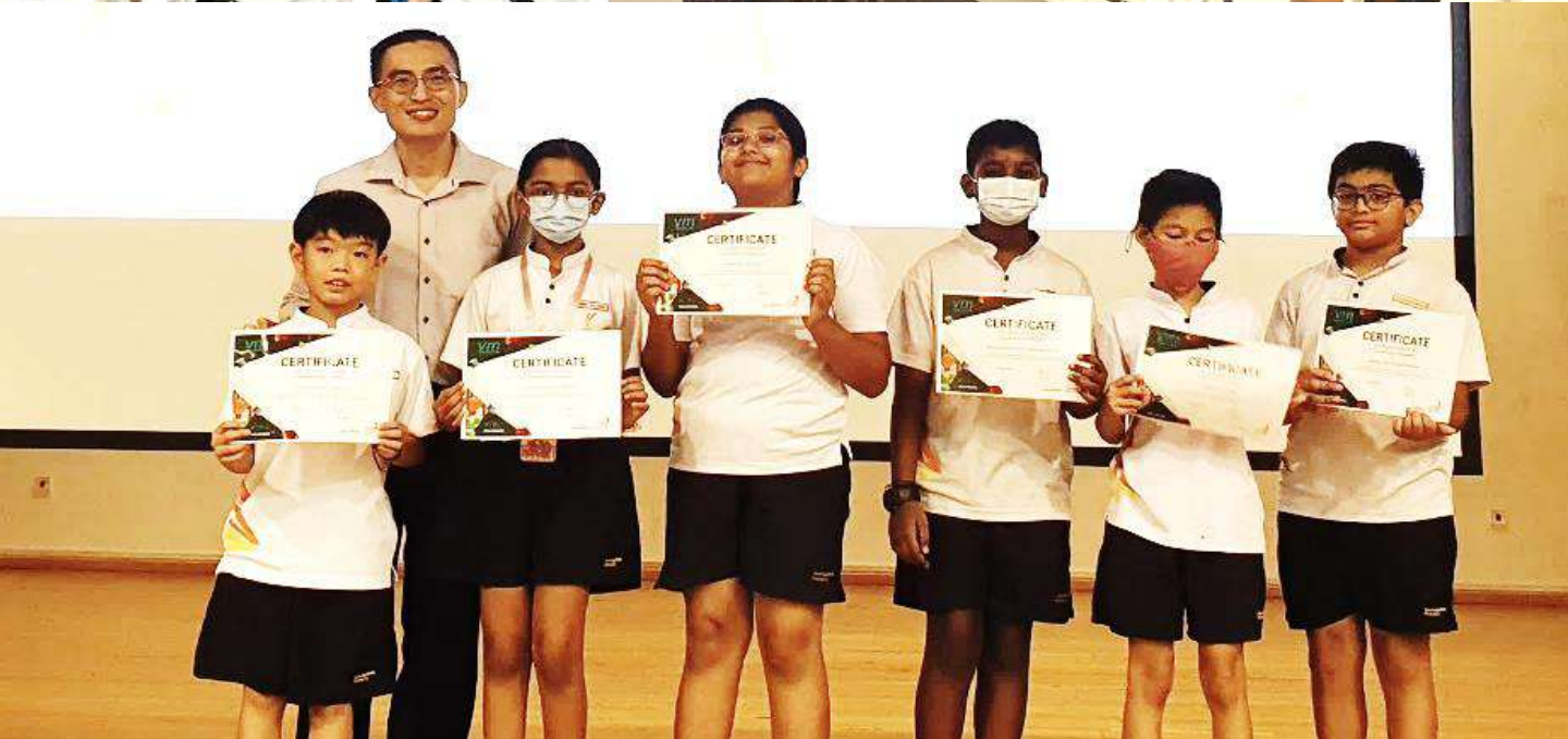
Congratulations to our P4 and P5 Prize Winners!

Despite having only one month of training, the P5 team clinched the 2 nd runner-up and the P4 team emerged in 5 th place. They also received the Sportsmanship Award. Congratulations!