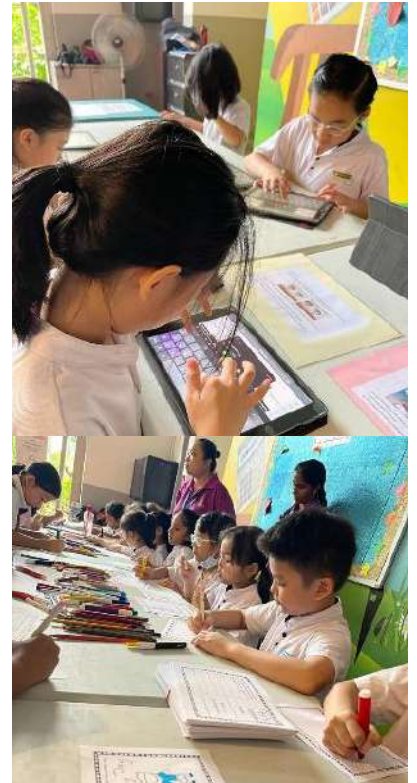
Racial Harmony recess activities

We were heartened to have the support of parents who volunteered their time interacting with our Springdalites and joining them as they completed the various activities.