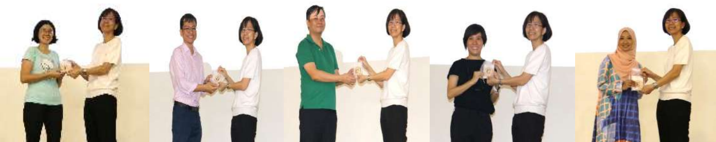
Congratulations to all the teachers!

The "GREAT" Awards were also presented to our teachers. These teachers have been nominated by their colleagues for demonstrating the "GREAT" expectations of staff.