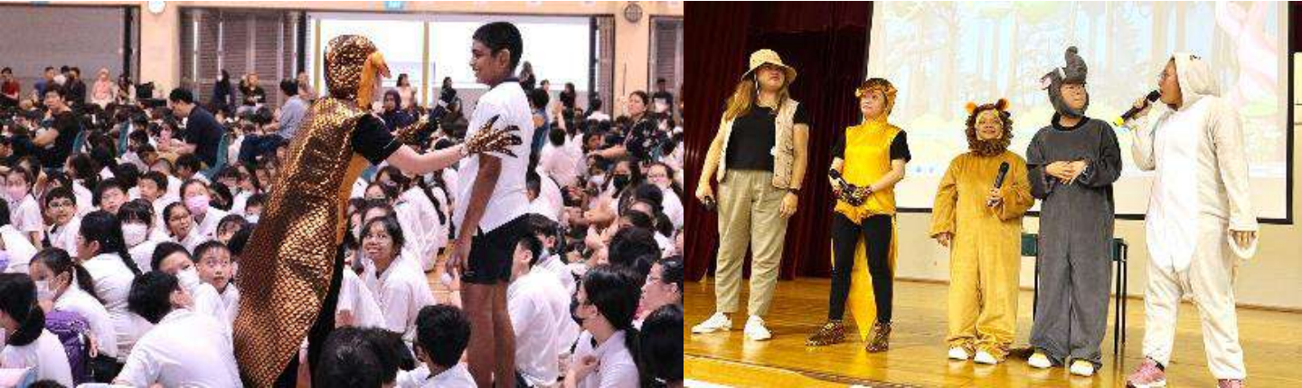
Springdalites participating actively during Quiz time

Springdalites commemorated Racial Harmony Day on 21 July. During assembly, Springdalites watched a performance entitled 'Party at the Night Safari' . The interactive play taught children about diversity in the community and the importance of respecting the different races and cultures.