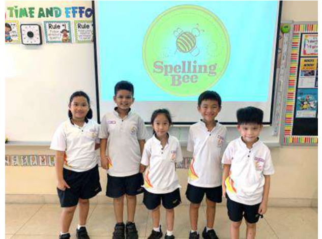
Our P1 Spelling Bee Competition Winners

Students put their spelling skills to the test in a friendly Spelling Bee Competition which aimed to enhance vocabulary and language proficiency and instill a sense of confidence in students' language abilities.