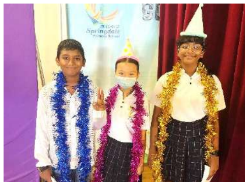
Our P5 Student Leader emcees

The school celebrated Teachers' Day on 31 August. To show their appreciation for teachers, our student leaders and class monitors penned thank you notes for the teachers and non-teaching staff in the school.