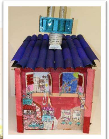
Category B – Hawker House