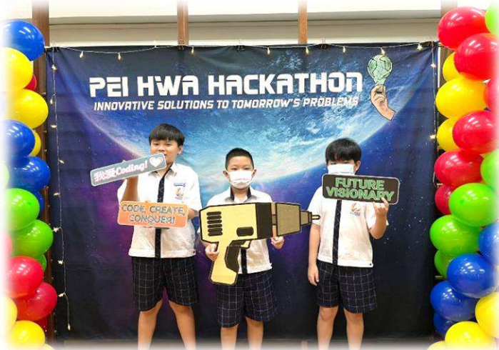
Our talented Springdalites in Action!

The theme for the Pei Hwa Hackathon is Innovative Solutions to Tomorrow's Problems. The team's project, titled Med-Bot , aims to remind the elderly to take their medicine on time.