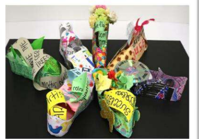
Category C- Walk In My Shoes