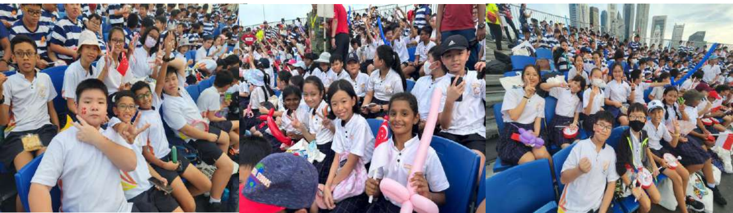
Our P5 Springdalite posing for photos with their friends as memories of this special event

Our Springdalites braved the heat and joined enthusiastically with the emcees of the Parade in singing the National Day songs. They showed encouragement to the performers by cheering and applauding for them throughout the show.