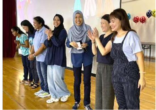
Thank you PVs for your support!

The Springdale Parent Volunteer Club chipped in with their games item during the celebration. Our Springdalites and teachers had a great fun together. Thank you parent volunteers for the wonderful session.