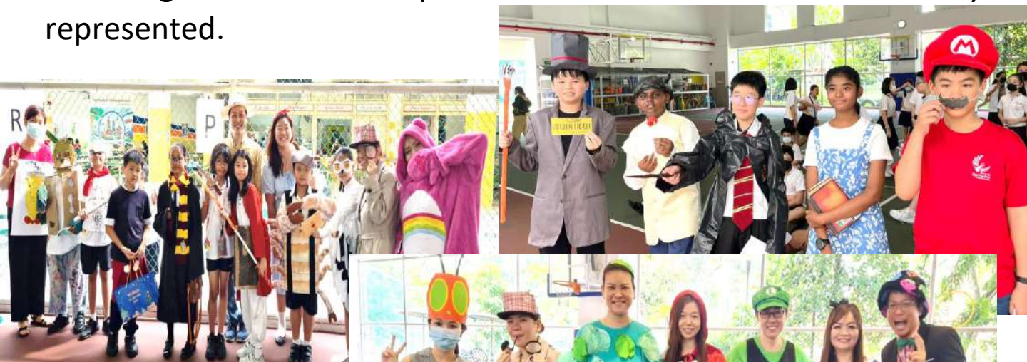
Springdalites and teachers dressed themselves up in their favourite book characters

Imagination then took center stage on Book Character Day. Springdalites and teachers dressed up as their favorite characters from various books, bringing literature to life. Students were encouraged to delve deeper into the stories and themes they represented.