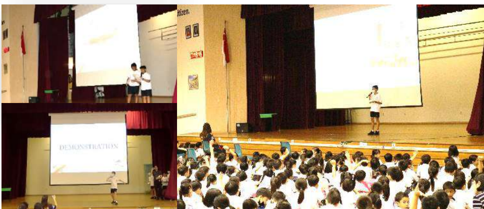
Sharing by participants of SAFMC and Fly High Aviation Carnival during assembly

Our Springdalites were wowed by the 'paper plane throw' demonstration by our participants! You can click the highlights of Science X-perience Week at this link .