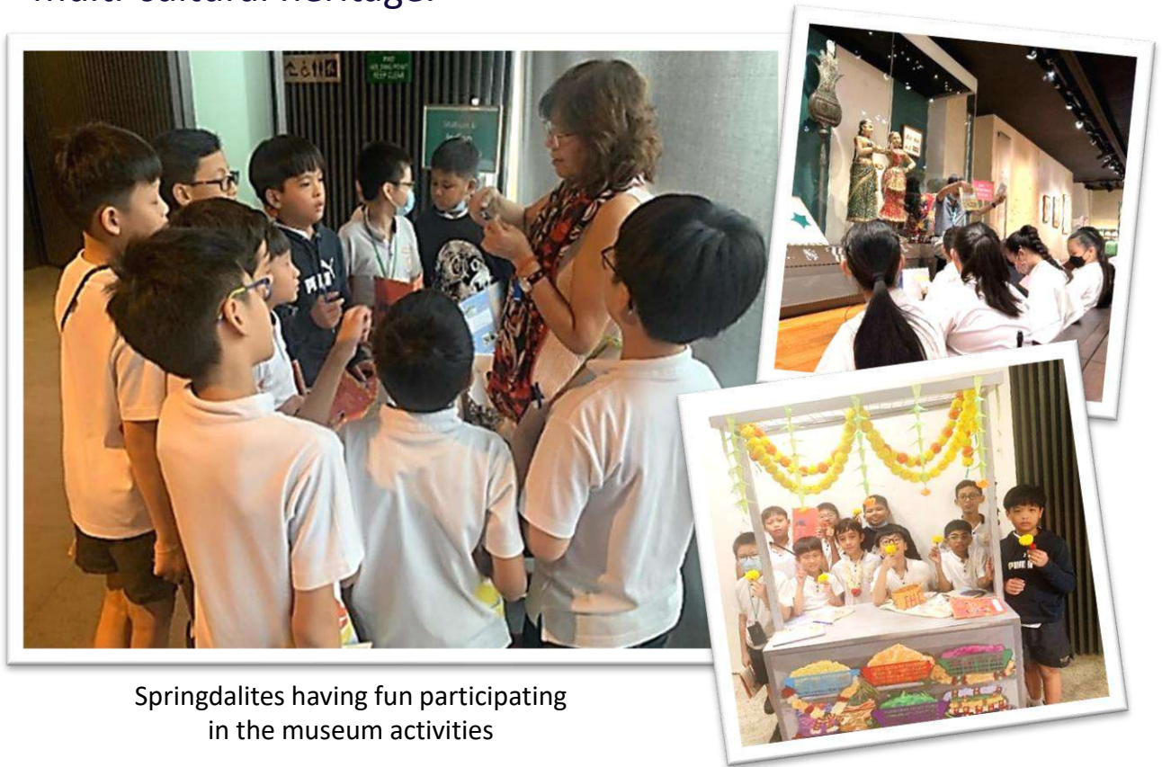
Springdalites having fun participating in the museum activities

In Term 3, our P5 Springdalites went for their Museum-based Learning Journey to the Indian Heritage Centre. Through this learning experience, our Springdalites recognised the contributions made by the Indian community in Singapore towards nation-building and understood how the different influences from the diverse cultures have shaped Singapore's multi-cultural heritage.