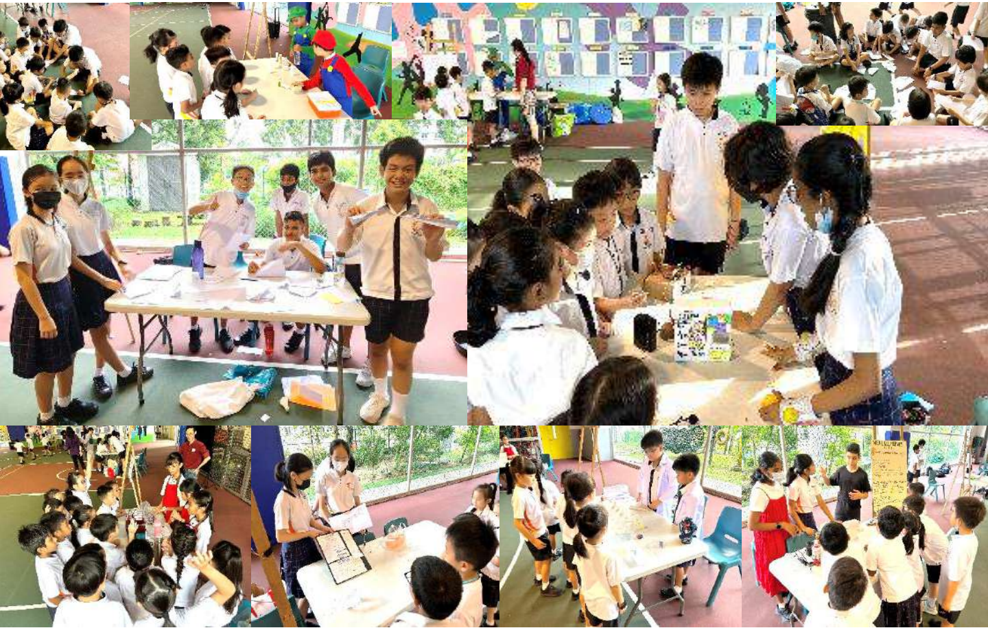
Science Buskers live demonstration during recess

There was also a Paper Plane booth by our participants from SAFMC who shared their experiences in folding paper planes.