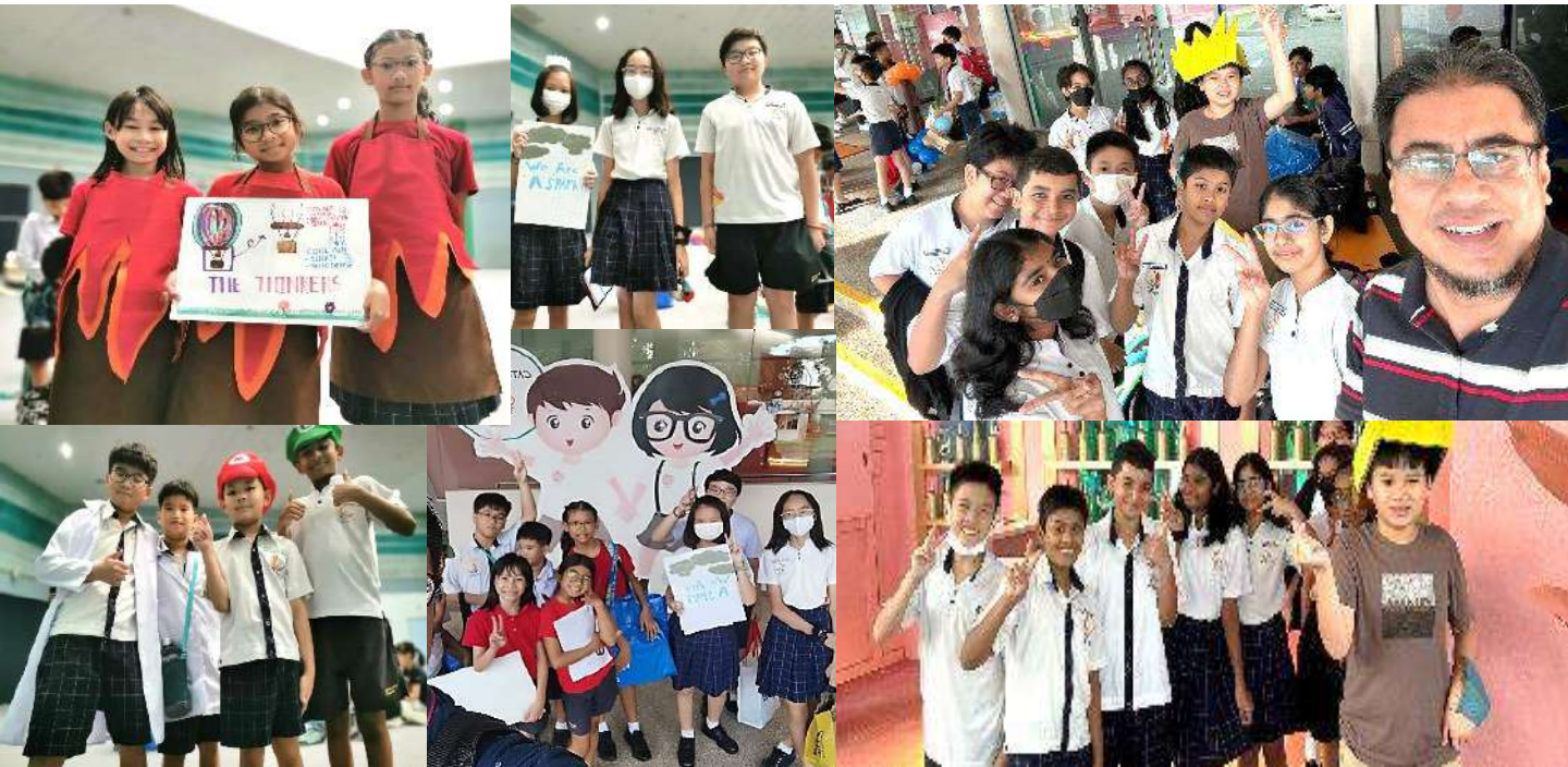
Our Science Buskers during the audition round at Science Centre

Our Springdalites worked hard to prepare for the competition with a few rounds of rehearsal and performed commendably during the audition round at Science Centre on 4 July.