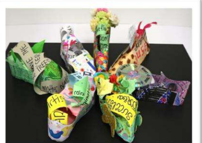
Category C- Walk In My Shoes