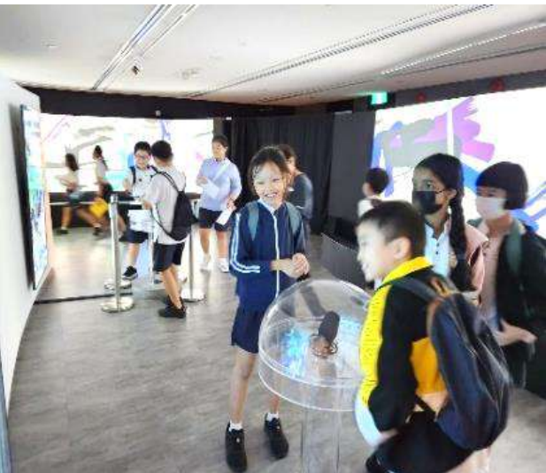
Interactive activities at the INK-credible Exhibit

The Art Department scheduled two visits to National Gallery Singapore on 30 June and 14 July. The visits serve as the core learning experiences for our P4 Springdalites as part of the Art curriculum.