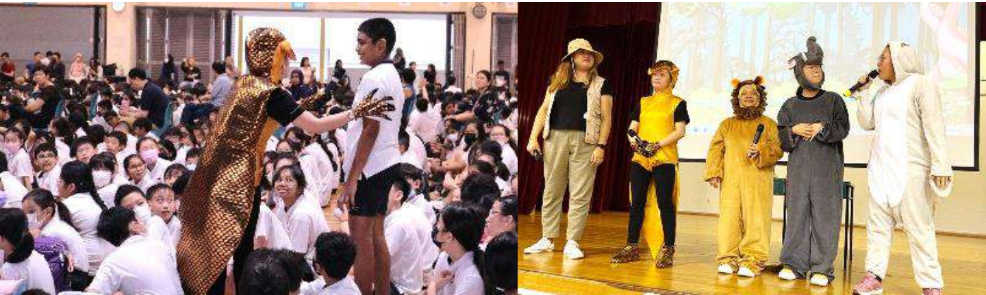
Springdalites participating actively during Quiz time

Springdalites commemorated Racial Harmony Day on 21 July. During assembly, Springdalites watched a performance entitled 'Party at the Night Safari' . The interactive play taught children about diversity in the community and the importance of respecting the different races and cultures.