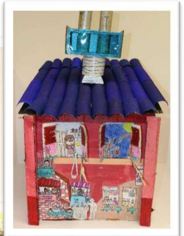
Category B – Hawker House