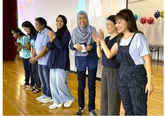
Thank you PVs for your support!

The Springdale Parent Volunteer Club chipped in with their games item during the celebration. Our Springdalites and teachers had a great fun together. Thank you parent volunteers for the wonderful session.