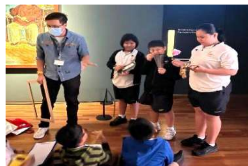
Listening attentively during the session