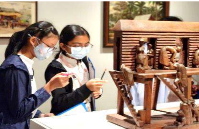
Studying the sculpture

The guided tours were led by the facilitators with knowledge and passion for the exhibits. There were interactive activities from the Children Biennale & hands-on art workshops to virtual reality experiences, making the entire learning a joyous adventure for everyone.