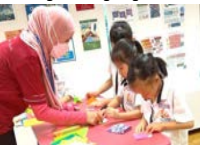
Springdalites and Parent Volunteers telling stories through folding origami

Fusing storytelling and origami, the Storigami Workshop invited students to explore the art of storytelling through the creation of paper masterpieces. Our enthusiastic parent volunteers guided participants in crafting origami characters and settings inspired by popular books. This hands-on workshop aimed to stimulate creativity, storytelling prowess, and an appreciation for the visual arts.