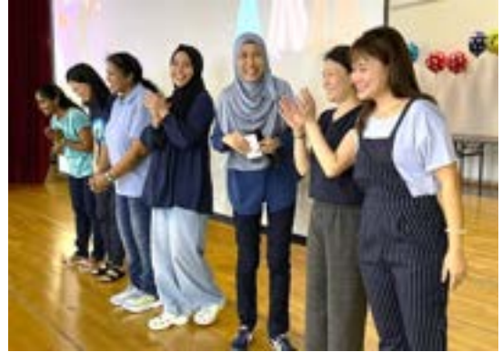
Thank you PVs for your support!

The Springdale Parent Volunteer Club chipped in with their games item during the celebration. Our Springdalites and teachers had a great fun together. Thank you parent volunteers for the wonderful session.