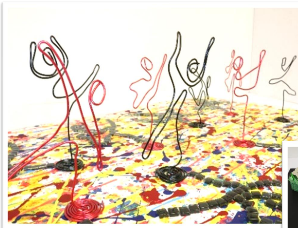
Category A – Rhythmic Splatters

Special congratulations to our Category A students on receiving a Certificate of Recognition for their entry.