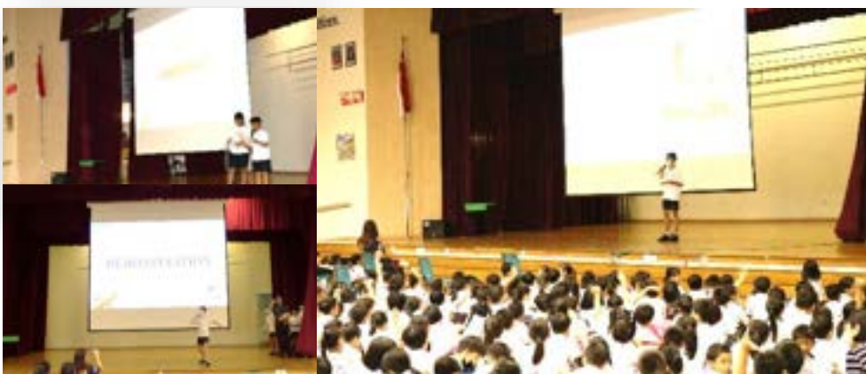
Sharing by participants of SAFMC and Fly High Aviation Carnival during assembly

Our Springdalites were wowed by the 'paper plane throw' demonstration by our participants! You can click the highlights of Science X-perience Week at this link .