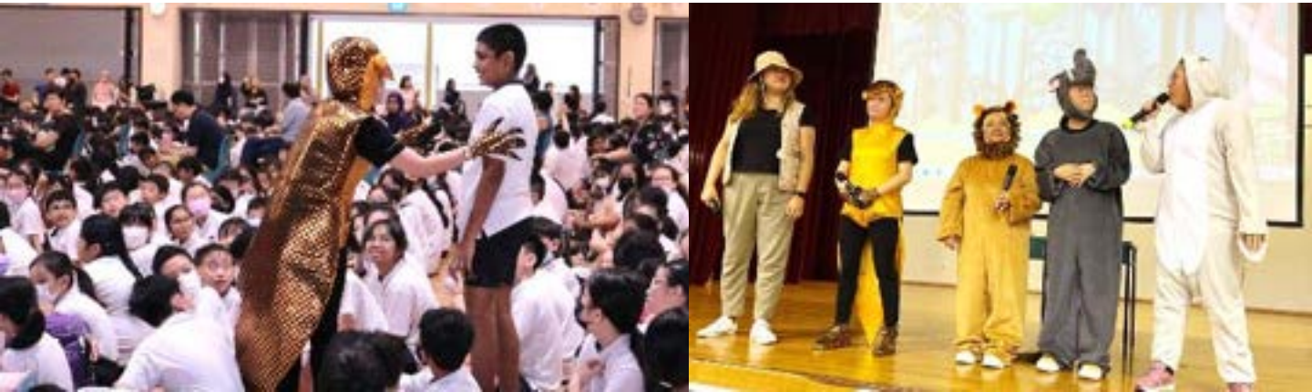
Springdalites participating actively during Quiz time

Springdalites commemorated Racial Harmony Day on 21 July. During assembly, Springdalites watched a performance entitled 'Party at the Night Safari' . The interactive play taught children about diversity in the community and the importance of respecting the different races and cultures.