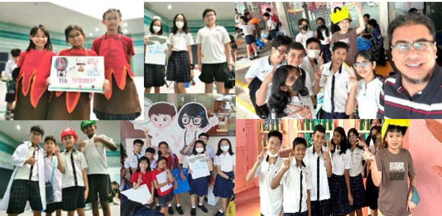
Our Science Buskers during the audition round at Science Centre

Our Springdalites worked hard to prepare for the competition with a few rounds of rehearsal and performed commendably during the audition round at Science Centre on 4 July.