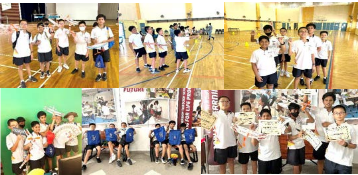
Participants of the Fly High Aviation Carnival at Changkat Changi Secondary School

During the carnival, our Springdalites had the opportunity to learn about various aspects of aviation through engaging workshops, including the various aspects of aircraft design, flight simulation and the future application of drones. They also participated in various hands-on activities, such as building and flying their own model aircraft and flying drones through obstacles.