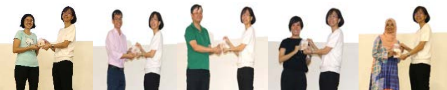
Congratulations to all the teachers!

The "GREAT" Awards were also presented to our teachers. These teachers have been nominated by their colleagues for demonstrating the "GREAT" expectations of staff.