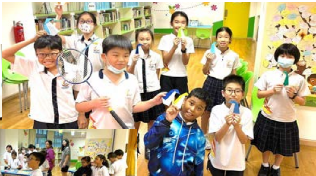
Proud Springdalites with their origami