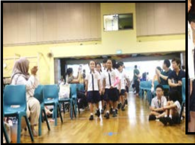
Student Leaders marching down the hall

On 30 June, the Student Leaders marched down the hall and onto the stage to stand proudly to pledge their commitment as student leaders of Springdale Primary School during the 2023 Student Leaders Investiture.