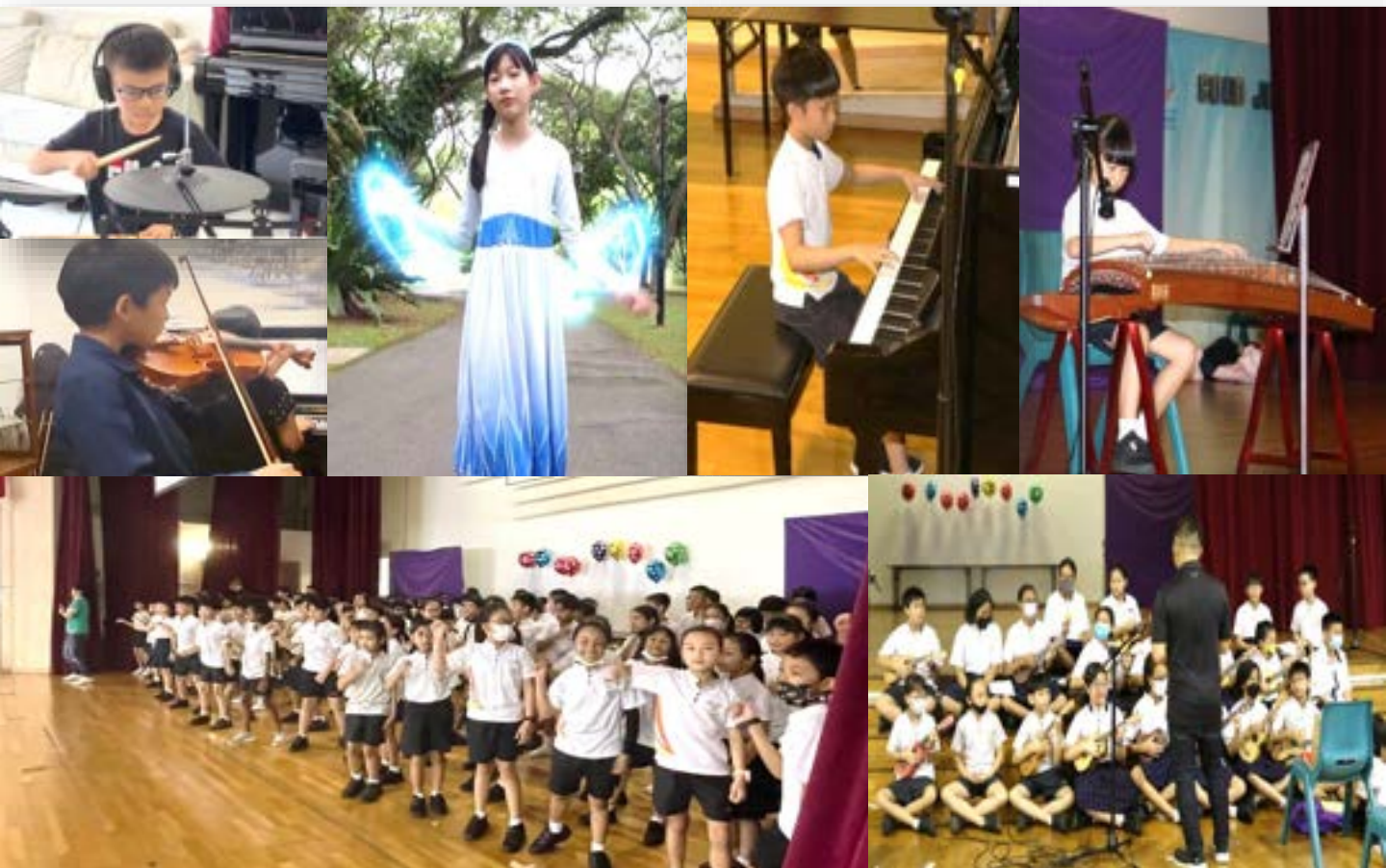
Springdalites showcasing their talents and musical skills

Our Springdalites showcased their talents through a variety of performances during the Teachers' Day concert, such as playing the piano, drum, Gu Zheng, singing and dancing.