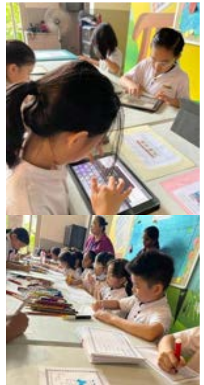
Racial Harmony recess activities

We were heartened to have the support of parents who volunteered their time interacting with our Springdalites and joining them as they completed the various activities.