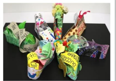
Category C- Walk In My Shoes