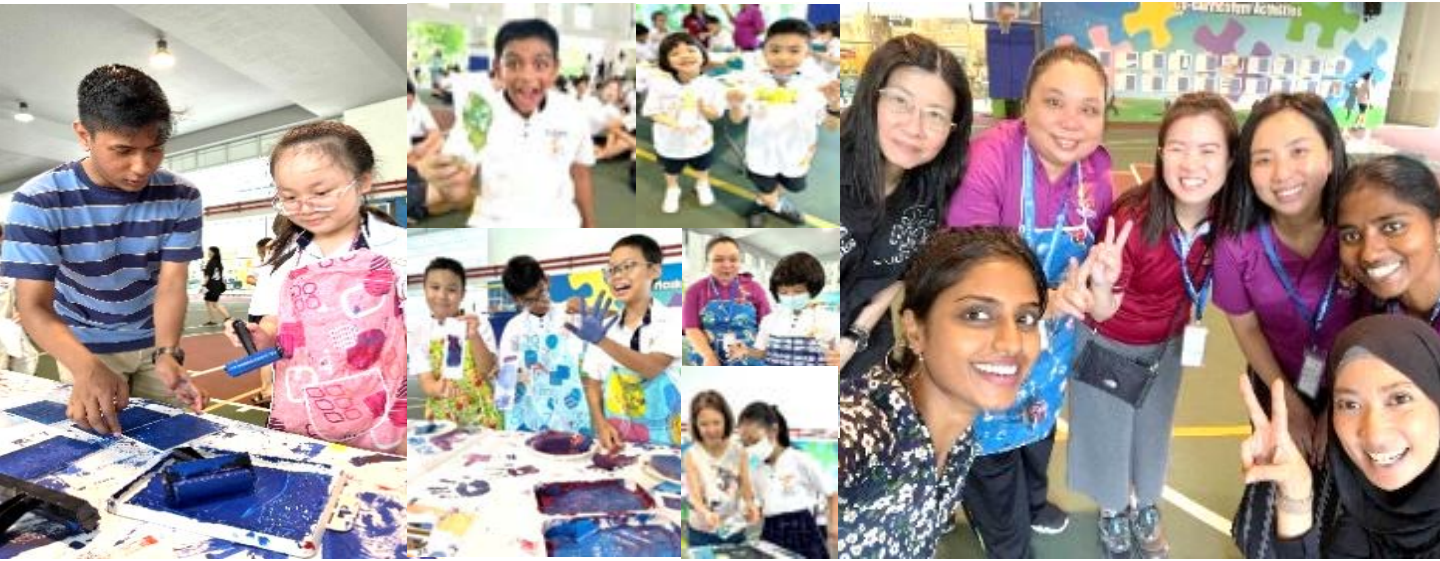
Springdalites exploring various Art Printmaking activities with the help of Art teachers and Parent Volunteers

On 28 July, we had our Aesthetics Moments @ Recess which aimed to promote the creative expression of Springdalites. Springdalites could showcase their musical talent and also try the hands-on activities at the Art Booth.