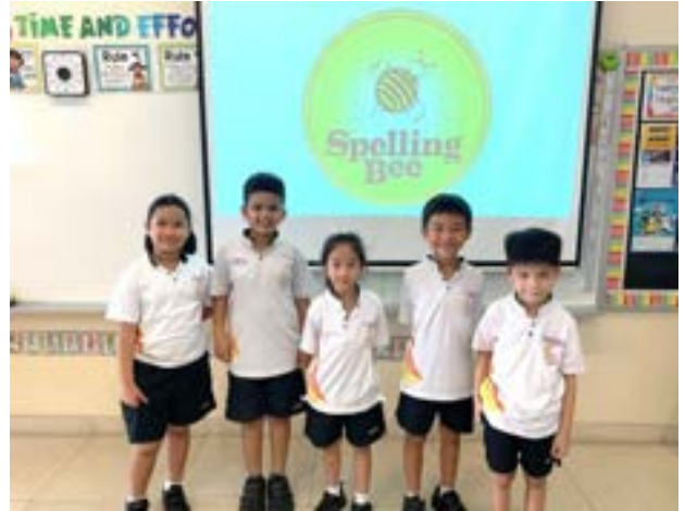
Our P1 Spelling Bee Competition Winners

Students put their spelling skills to the test in a friendly Spelling Bee Competition which aimed to enhance vocabulary and language proficiency and instill a sense of confidence in students' language abilities.