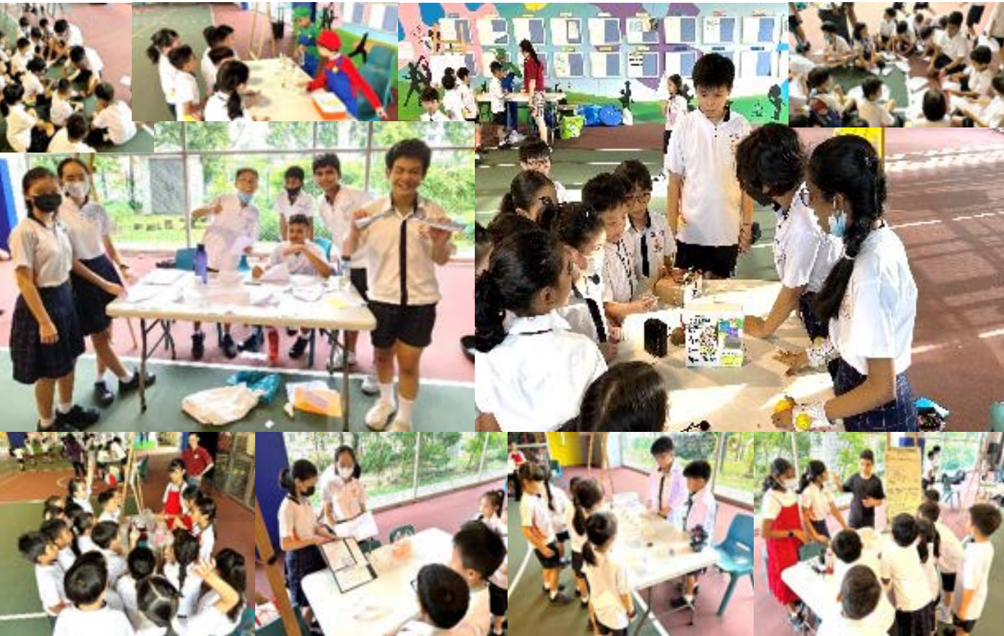
Science Buskers live demonstration during recess

There was also a Paper Plane booth by our participants from SAFMC who shared their experiences in folding paper planes.