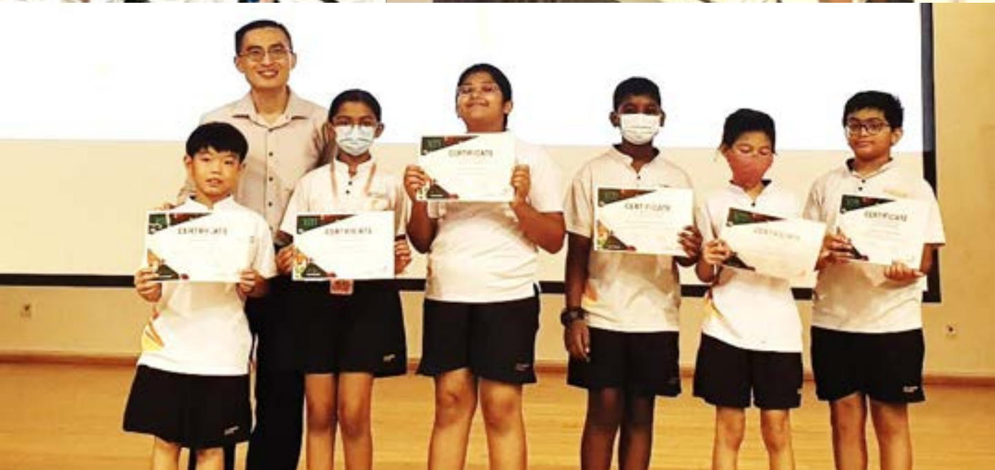
Congratulations to our P4 and P5 Prize Winners!

Despite having only one month of training, the P5 team clinched the 2 nd runner-up and the P4 team emerged in 5 th place. They also received the Sportsmanship Award. Congratulations!