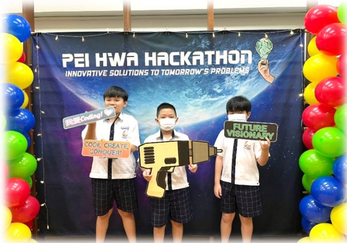
Our talented Springdalites in Action!

The theme for the Pei Hwa Hackathon is Innovative Solutions to Tomorrow's Problems. The team's project, titled Med-Bot , aims to remind the elderly to take their medicine on time.