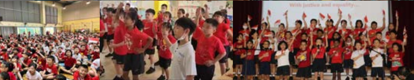
Springdalites celebrating National Day

There were also performances from our school's aesthetic CCAs, community singing, a game segment and a video segment of Springdalites' wishes for Singapore!