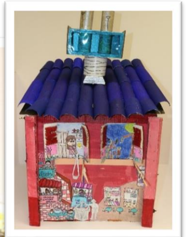
Category B – Hawker House