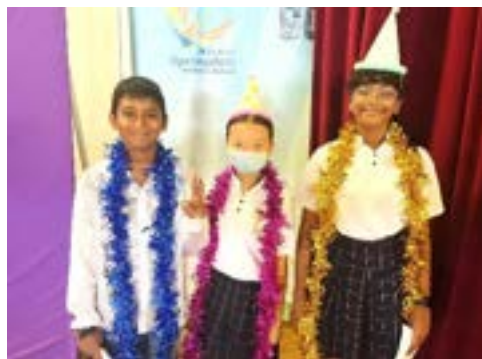
Our P5 Student Leader emcees

The school celebrated Teachers' Day on 31 August. To show their appreciation for teachers, our student leaders and class monitors penned thank you notes for the teachers and non-teaching staff in the school.