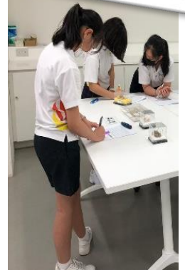
Springdalites at the various stations in Lee Kong Chian Natural History Museum

Meanwhile, our P6 students participated in a bio-diversity workshop cum guided gallery tour at the Lee Kong Chian Natural History Museum. A team of education officers engaged our students in learning and appreciating bio-diversity. They had hands-on experiences and observed different local specimens at specialised stations and tried to relate how living things adapted for survival. All students enjoyed the experience immensely.