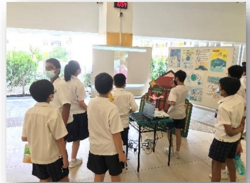
Springdalites watching the Science experiment videos during recess

We were privileged and honoured to have a renowned scientist, Prof Jackie Ying, who gave a talk on her journey as a scientist during the Assembly session. We hope the students were inspired by her sharing.