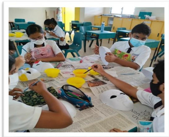
Springdalites enjoying the various activities

Students were engaged in various hands-on tasks such as story-telling, song appreciation, games and art. They also learnt to appreciate the heritage and culture associated with their Mother Tongue Languages.