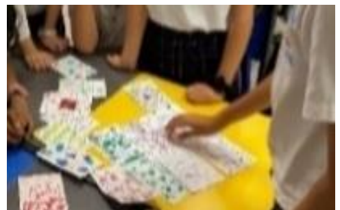
Springdalites putting their creativity to work