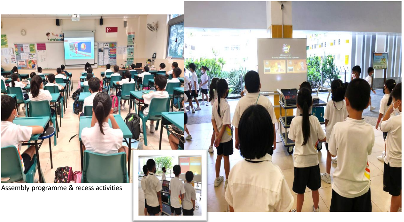
Assembly programme & recess activities

Our Springdalites commemorated IFD with a class-based assembly where they learnt the importance of Singapore having strong ties with all countries. Singapore's contribution to the world during the pandemic was also highlighted.