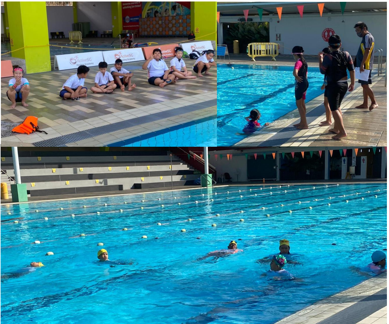
Springdalites picking up water survival skills

We hope that our P4 students have enjoyed themselves and are more proficient in swimming.