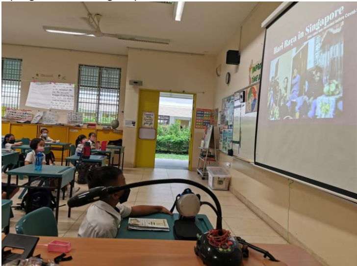
Springdalites watching the pre-recorded concert in their classroom

The main highlight of the celebration was the pre-recorded concert with performances by students and teachers. Springdalites learn about the significance of Hari Raya and how the festival is celebrated around the world through the concert, quizzes and craft stations.