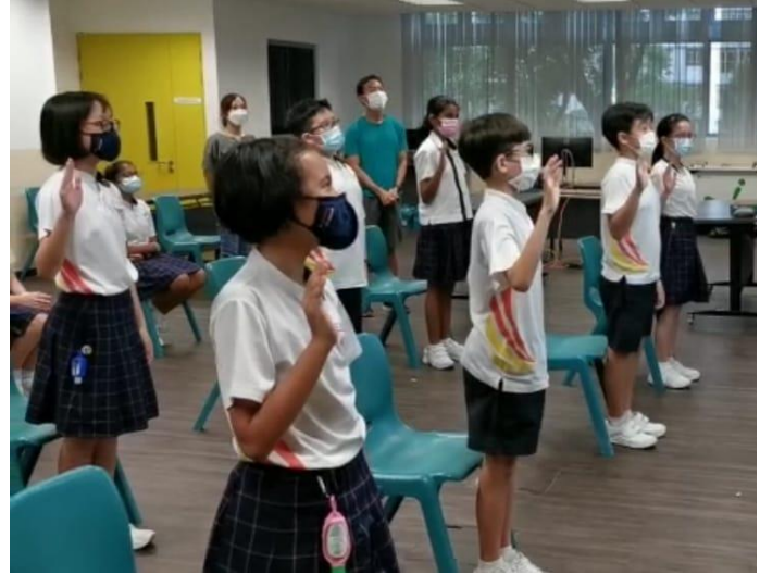
P5 Student Leader Council taking the pledge

We look forward to their efforts and contributions in fostering a positive school culture for all.