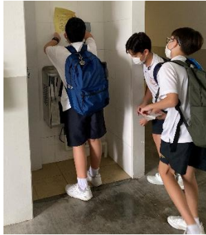
First task: Displaying posters on peer support