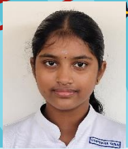
Yazhini (P4) Art Club

... sharing ideas and coming up with creative solutions