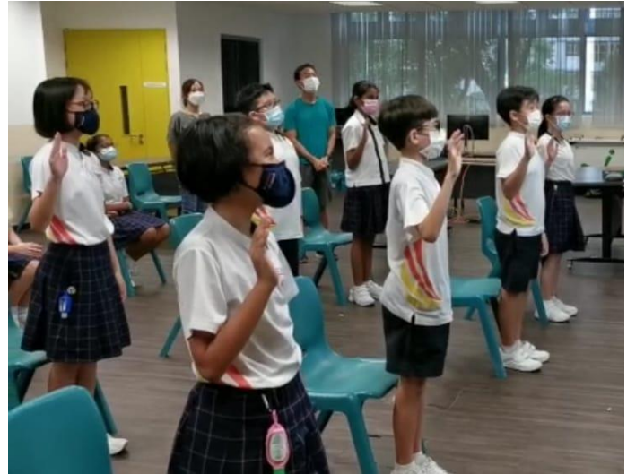
P5 Student Leader Council taking the pledge

We look forward to their efforts and contributions in fostering a positive school culture for all.