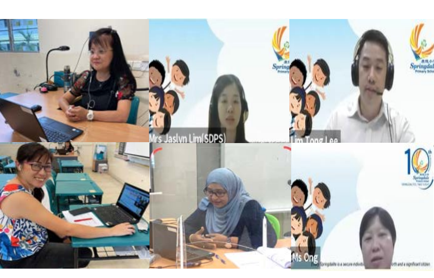
Our Year Heads, Key Personnel & Form Teachers conducting the Parents' Briefing