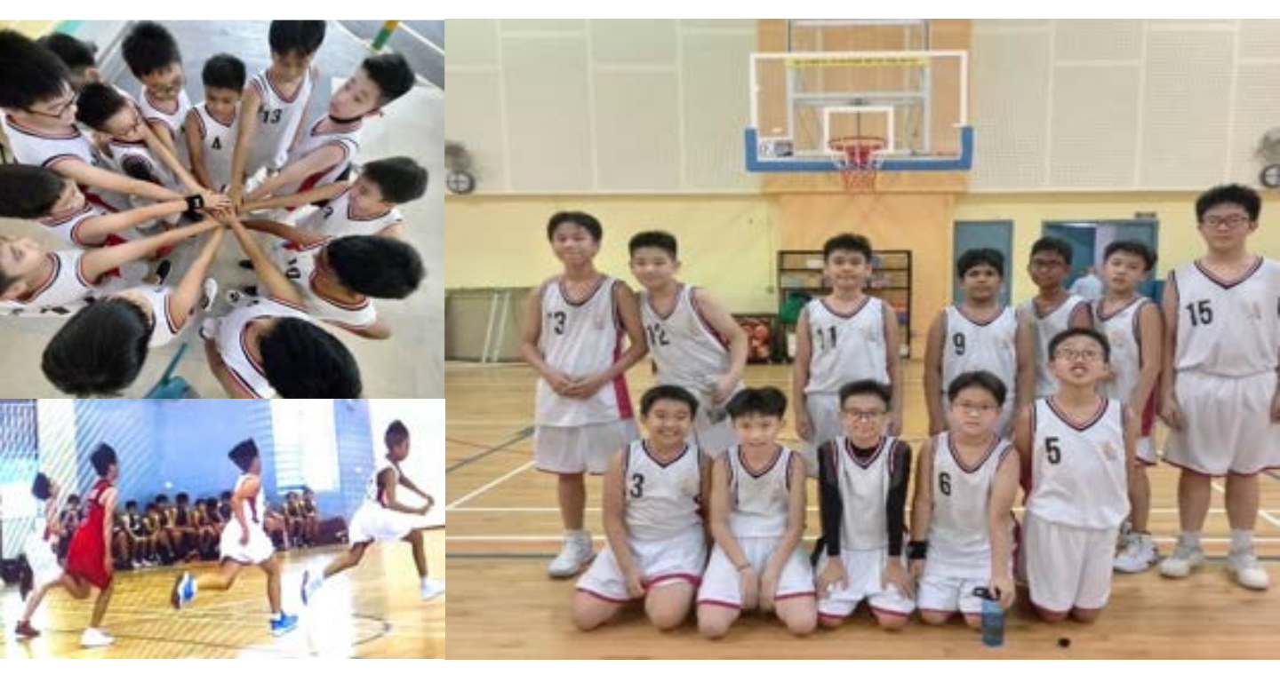
Our Basketball Senior Boys in action

Our Springdalites have displayed teamwork and resilience in the recent National School Games. We are immensely proud of them and would like to affirm our Senior Boys for their effort!