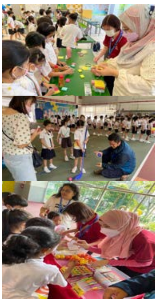
Parents, join us now!