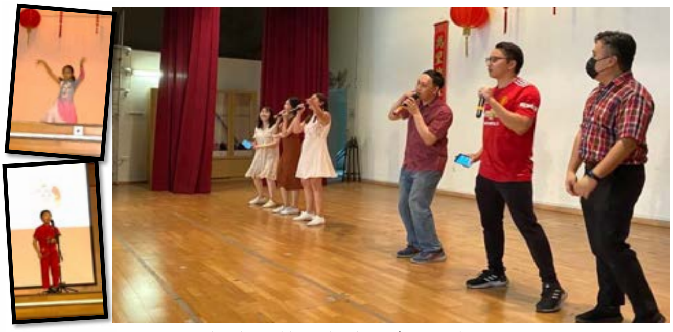
Our talented Springdalites and teachers performing on the stage