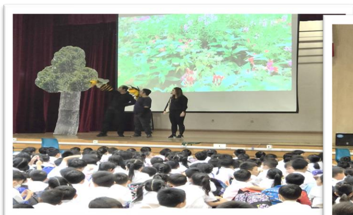
Skit during assembly programme

“We ‘Beelong’ Together” is an assembly programme by NParks to promote greater awareness on how students can play their part in protecting the ecosystem and enhancing Singapore's rich biodiversity. Springdalites learnt about the correct behaviours when they visit gardens and parks, and most of all, to appreciate all living things as each of them play an important role in the ecosystem.