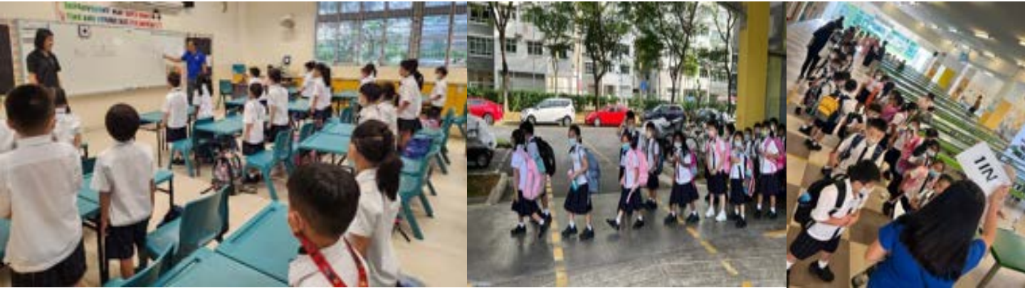
Ready to start the day with our teachers!