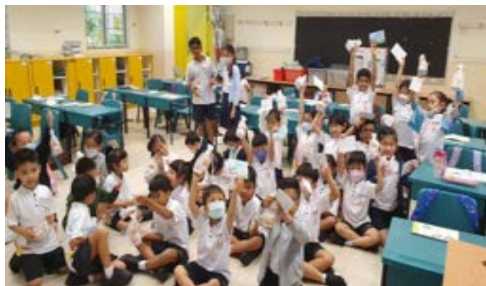
A short Welcome Speech by the Primary 4 Class Monitors