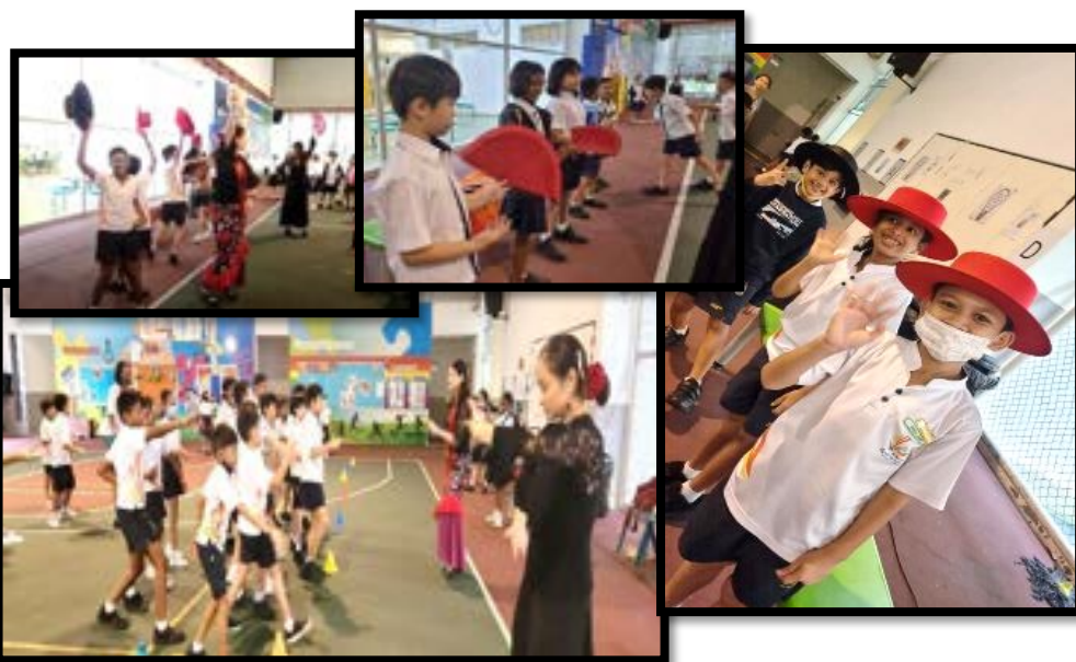
Springdalites trying out Spanish Flamenco dance moves

During the recess breaks, our Springdalites were engaged in the Spanish Flamenco dancing and music in the Indoor Basketball Court (IBC). Two professional Flamenco dancers led the participants in learning some dance moves. It was not only an unforgettable musical experience for our Springdalites, it was also a time for them to show respect and learn about different cultures through music.