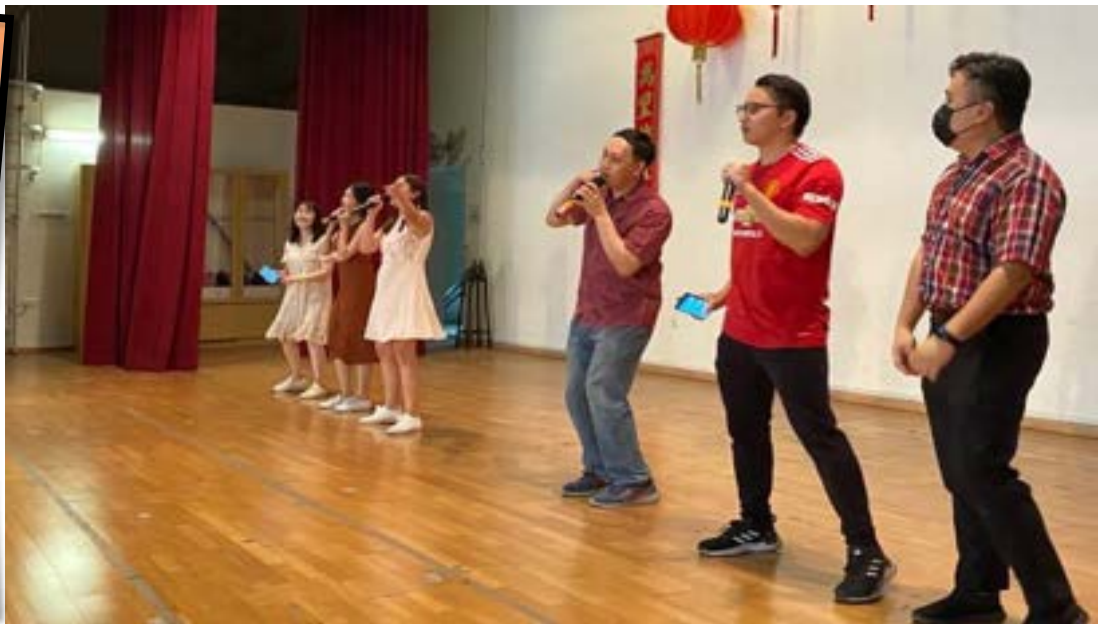
Our talented Springdalites and teachers performing on the stage