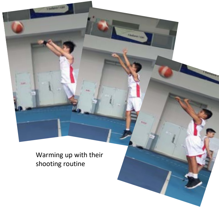
Warming up with their shooting routine

National Sports Games 2023 started In January shortly after Chinese New Year. The annual competition provides a valuable platform for our students to cultivate values and develop character through sports, upholding the Sports Council’s motto of “Character in Sporting Excellence”.