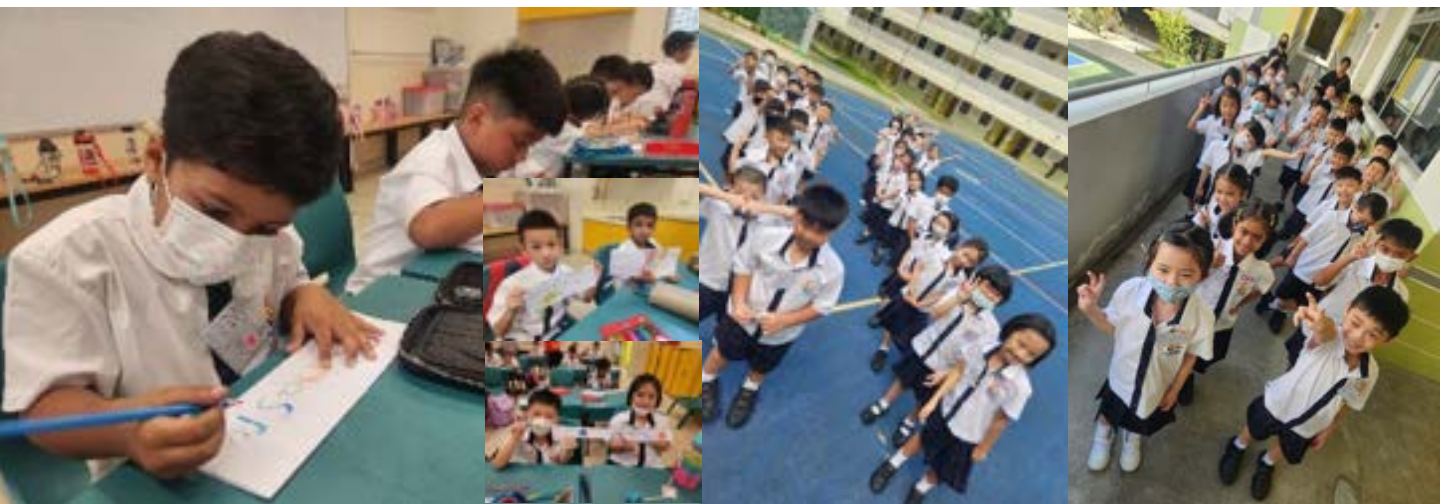
Settling into the class