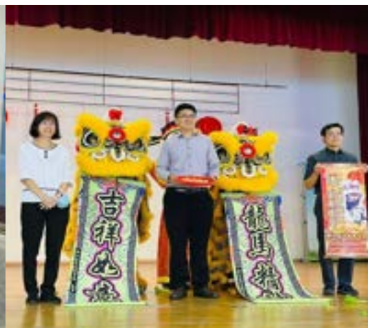
Well-wishes from our teachers and invited guests