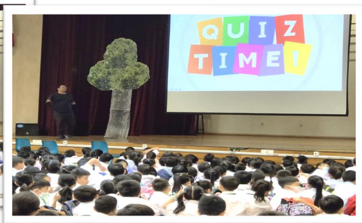
Quiz Time for Springdalites