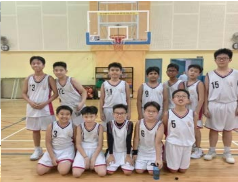
Our Basketball Senior Boys Team