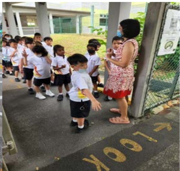
Listening attentively to teacher