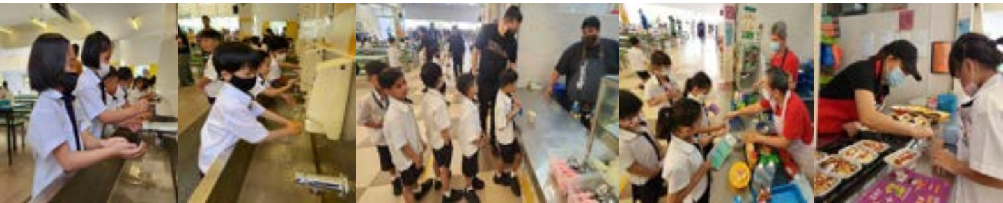
Handwashing routines during recess