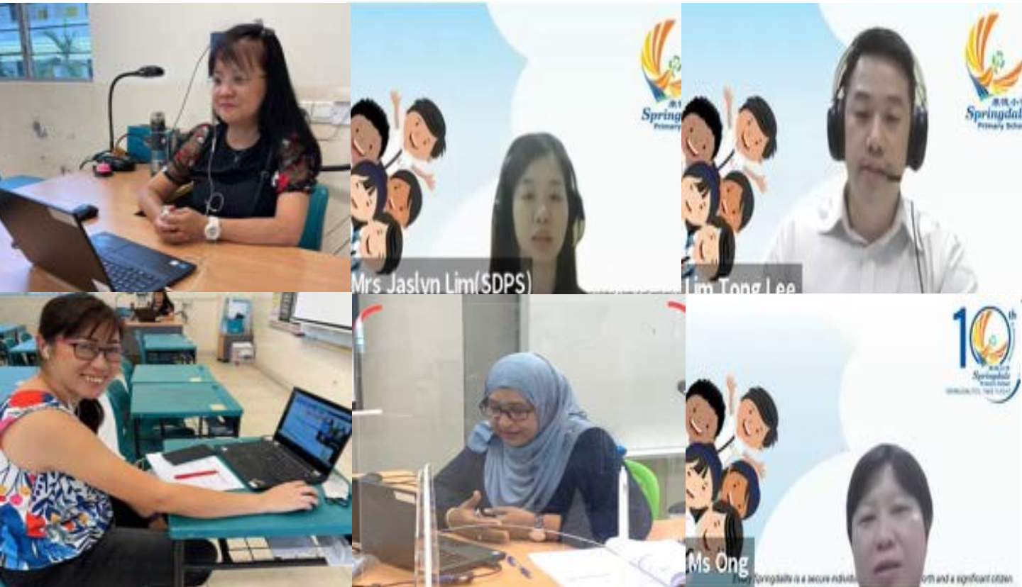
Our Year Heads, Key Personnel & Form Teachers conducting the Parents' Briefing