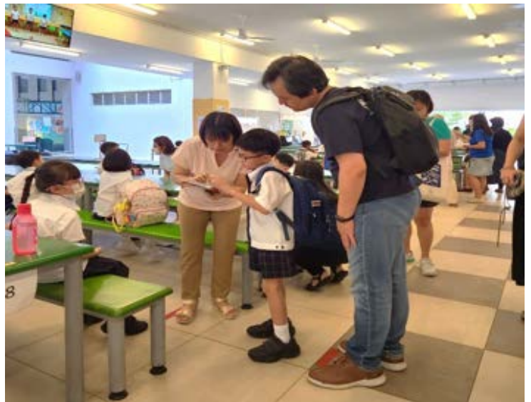
P1 Springdalites arriving at the canteen, accompanied by their parents