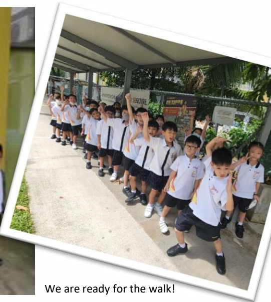
We are ready for the walk!