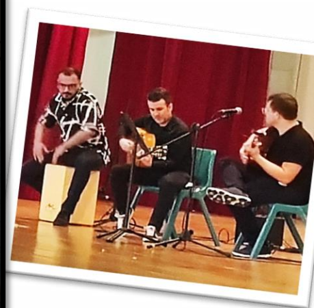
Musicians performing Spanish music live on stage