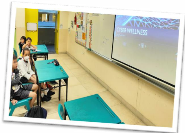
Class assembly programme on Cyber Wellness

This term's Cyber Wellness Assembly covers the topic on hacking and scams. Springdalites learnt that everyone plays a part in Singapore's digital defence. This starts with the individual guarding against hacking and scamming which can lead to loss of money and privacy.