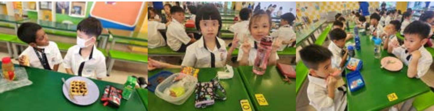
Enjoying the interaction with friends during recess