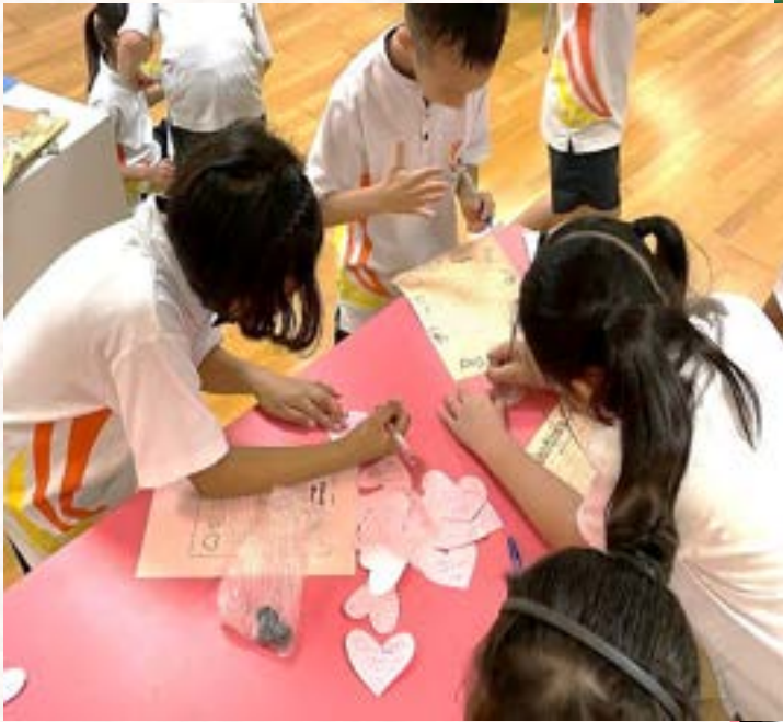
Penning down notes for people we CARE