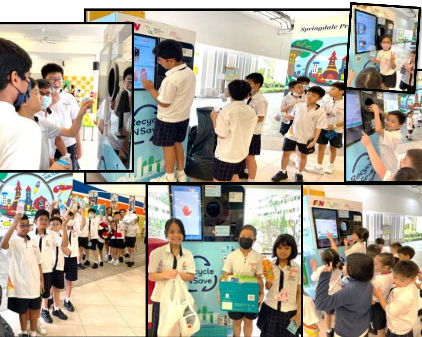
Springdalites enthusiastically bringing recyclable bottles and cans to deposit into the RVM

The school is promoting recycling within the school. With the loan of the RVM, students can deposit plastic beverage bottles and aluminum cans into the machine themselves. Our Springdalites have displayed exceptional passion and commitment to participate in this recycling programme!