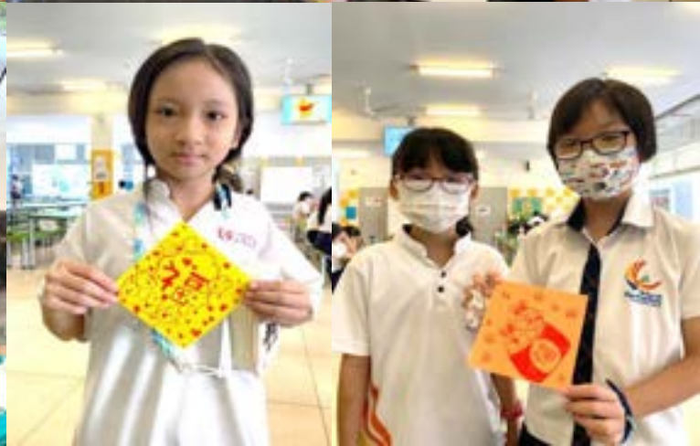
Springdalites writing down CNY wishes for their friends and family