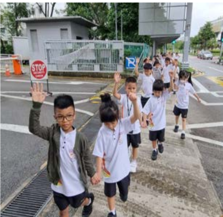
Practising kerb drill when crossing the road