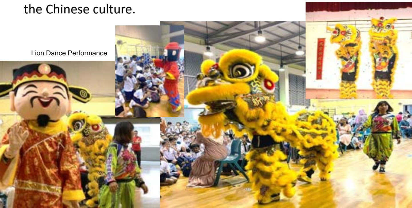
Lion Dance Performance

Interactive activities such as drawing and writing auspicious words on origami papers were carried out during recesses to provide students with hands-on experience to learn more about the Chinese culture.