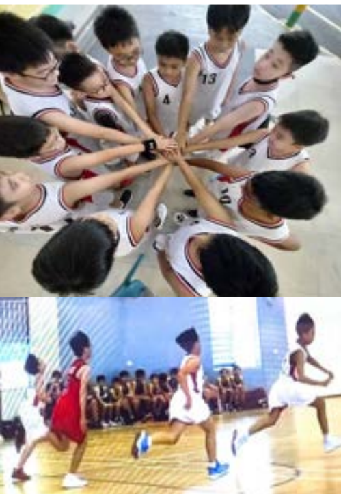
Our Basketball Senior Boys in action

Our Springdalites have displayed teamwork and resilience in the recent National School Games. We are immensely proud of them and would like to affirm our Senior Boys for their effort!