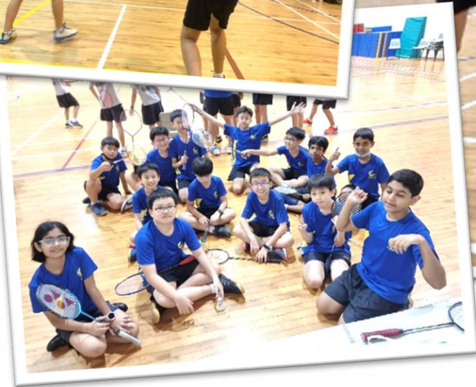
Our Springdalites giving their best during the competition!