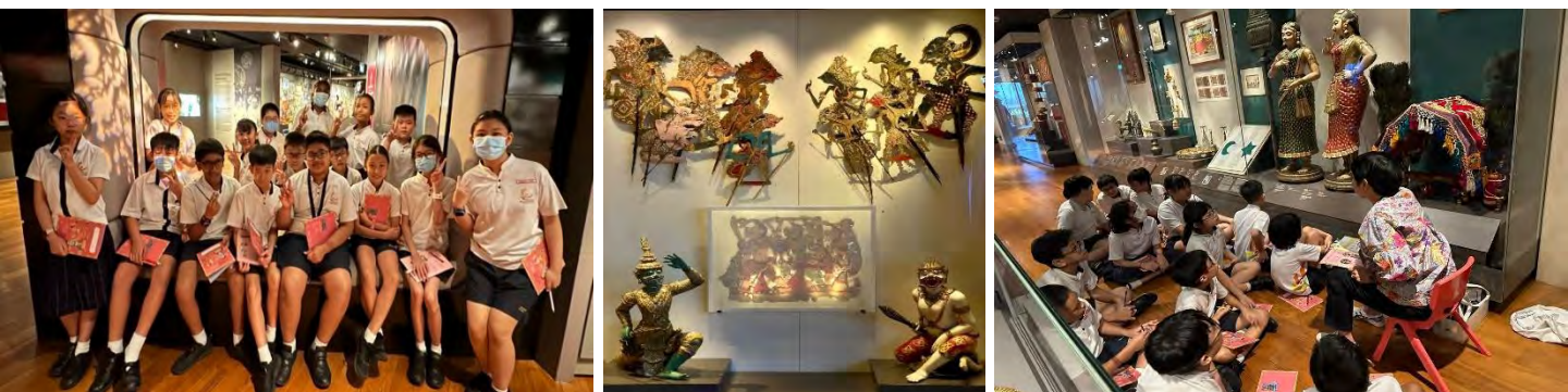
Students enjoying the enriching experience together at IHC with classmates