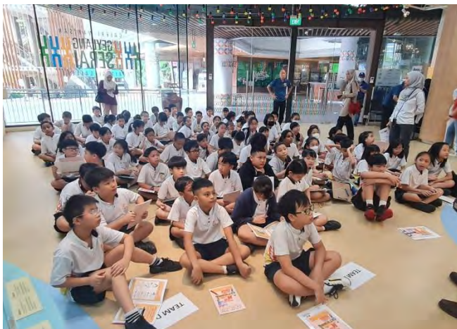
Students actively listening to the briefing by the facilitators before the tour

The Primary 4 students went to Geylang Serai Heritage Gallery for their learning journey. Students were guided to learn more about the history of Geylang Serai and the cultural-practices of the Malay-Muslim community in Singapore.