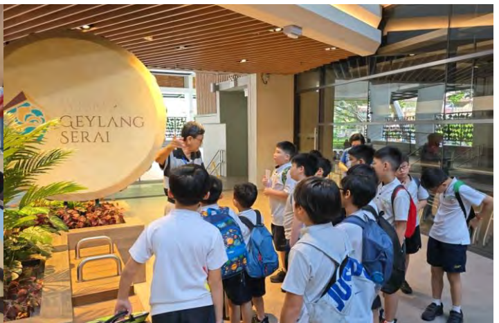
Understanding the exhibits around Wisma Geylang Serai

The guided tours were led by knowledgeable and very engaging facilitators. Students experienced folding their own tanjak (a headgear worn by the males) and also played a game of gasing (spinning top). At the end of the tour, the students had a better appreciation of the history of Geylang Serai and the Malay culture in Singapore.