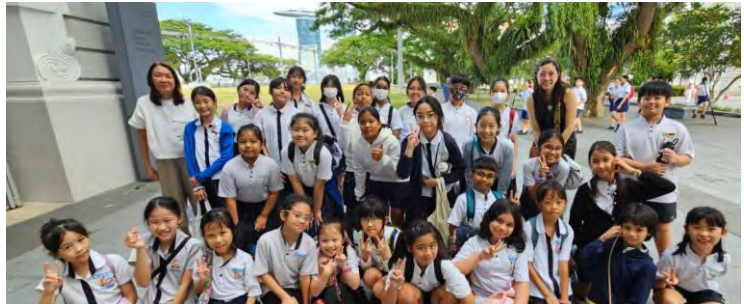
Springdalites and teachers were all smiles after watching the musical.