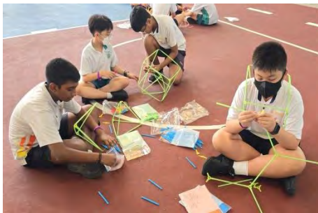
Building the strongest bridge using Strawbees with Fern Green Primary School students

Throughout the event, students tackled various challenges such as building the tallest tower, designing and flying paper airplanes. Additionally, the P5 Inno-T(h)inkers Club showcased their creativity by presenting innovative ideas to enhance student workspaces. This event not only enhanced the students' inventive thinking and communication skills but also helped them build meaningful connections and friendships.