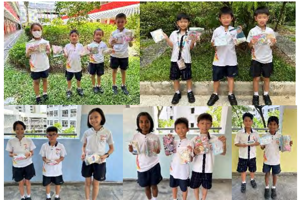
The winners of the 15 videos with their prizes

More than 50 videos were submitted! These videos were shown during recess and in class during the week. The top 15 videos were awarded prizes. You can click this link to watch a compilation of the videos submitted.