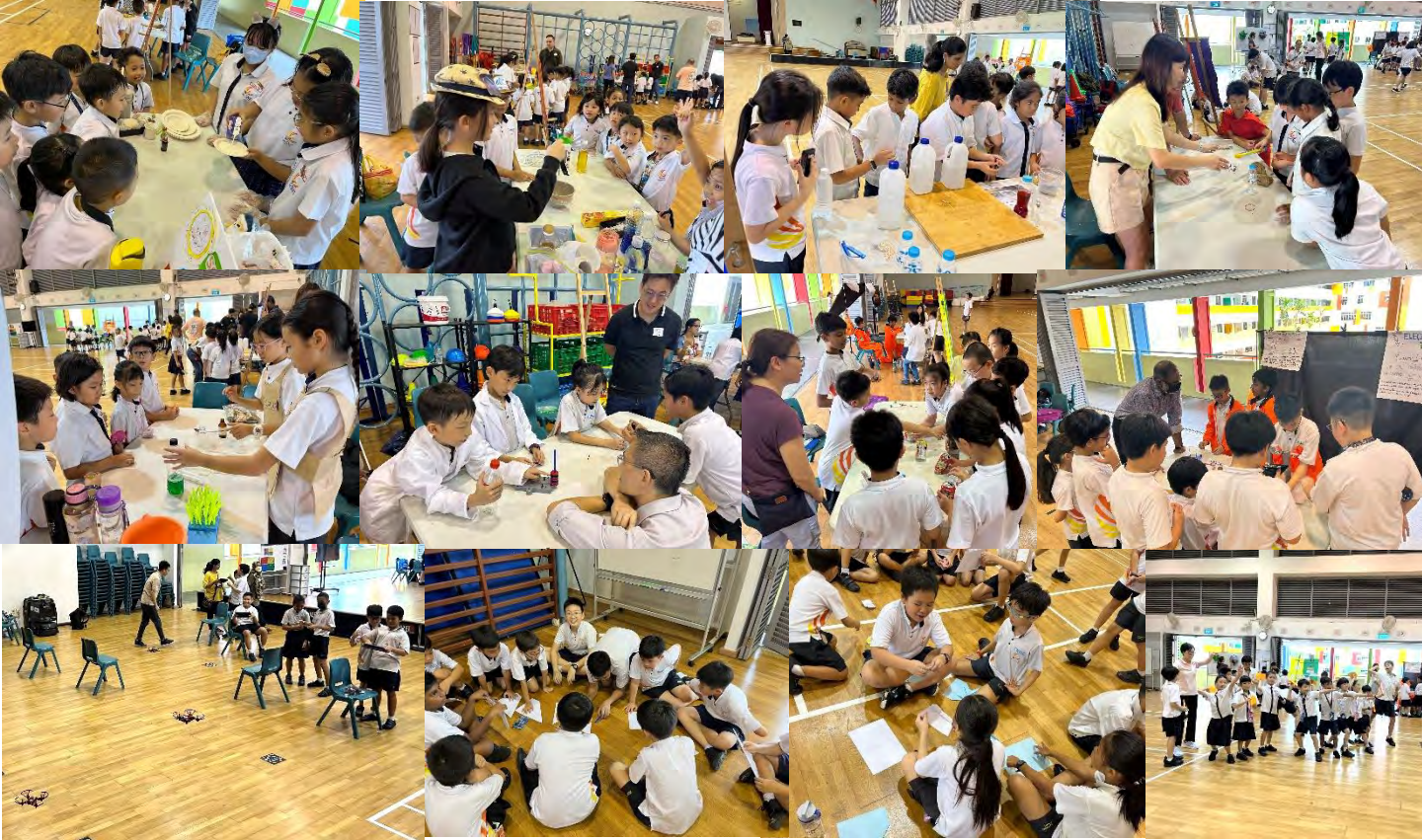
Our Springdalites engaging in various exciting Science activities during recess

There was also a Paper Plane booth by our participants from SAFMC who shared their experiences in folding paper planes. Besides that, there was also a Drone Experience activity for our P4 to P6 students.