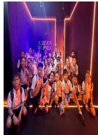
Students in action during the guided tour at Trick Eye Museum and Madame Tussauds Singapore