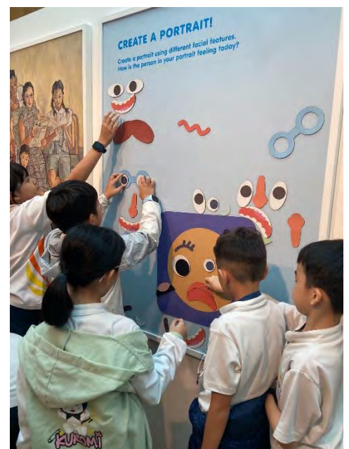
Students engrossed in art activity

The programme included interactive activities from the Children's Biennale, hands-on art workshops, and even virtual reality experiences, making learning a joyous adventure. Students left with a deeper appreciation for art, feeling both inspired and valued as young artists.