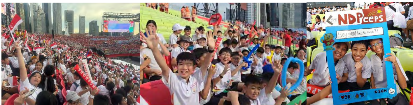
Our P5 students posing for photos with their friends.