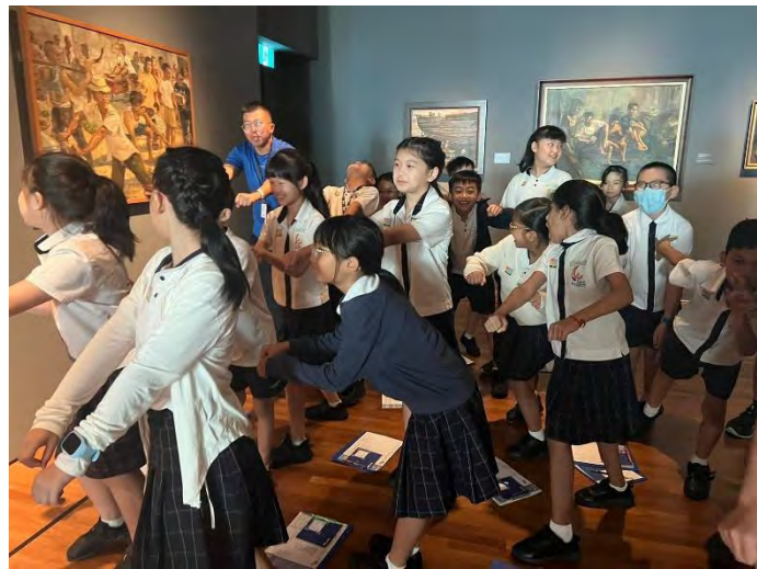
Students participating in art discussions about local artists and their artworks

The programme included interactive activities from the Children's Biennale, hands-on art workshops, and even virtual reality experiences, making learning a joyous adventure. Students left with a deeper appreciation for art, feeling both inspired and valued as young artists.