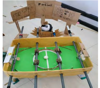
The innovative toys created by the students