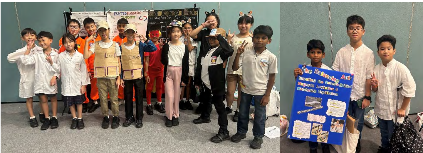
Our Science Buskers during the Audition Round at Science Centre

Our Springdalites worked hard to prepare for the competition with a few rounds of rehearsal and performed commendably during the Audition Round at Science Centre on 5 July.