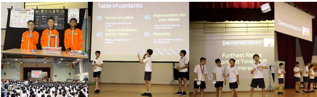
Science Buskers demonstration and sharing by participants of SAFMC during assembly

During assembly, there was a Science Buskers demonstration by one of the teams who participated in the Singapore Science Buskers competition this year. The participants of the Singapore Amazing Flying Machine Competition (SAFMC) also shared their learning experiences. Our Springdalites were wowed by the 'paper plane throw' demonstration by our participants! You can click the highlights of Science X-perience Week at this link .