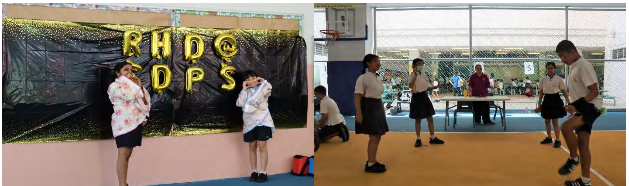
Springdalites taking part in various activities together

These activities fostered appreciation for different cultures and strengthened the bonds within the Springdale community.