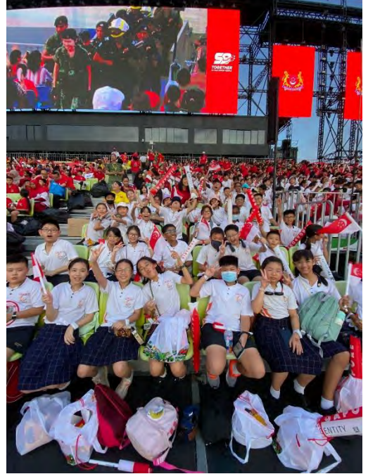
Watching the contingents marching onto the spectator stands

At the finale, they were fascinated by the spectacular fireworks while singing passionately to this year's theme song, "Not Alone". Through this NE show, our students realised the collective strength of Singaporeans standing together as one united people to honour our nation's progress and to express our love for Singapore!