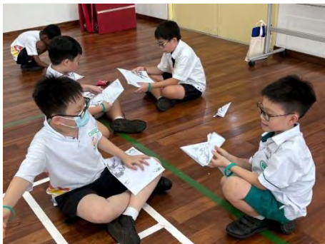
Learning from one another how to fold paper airplanes