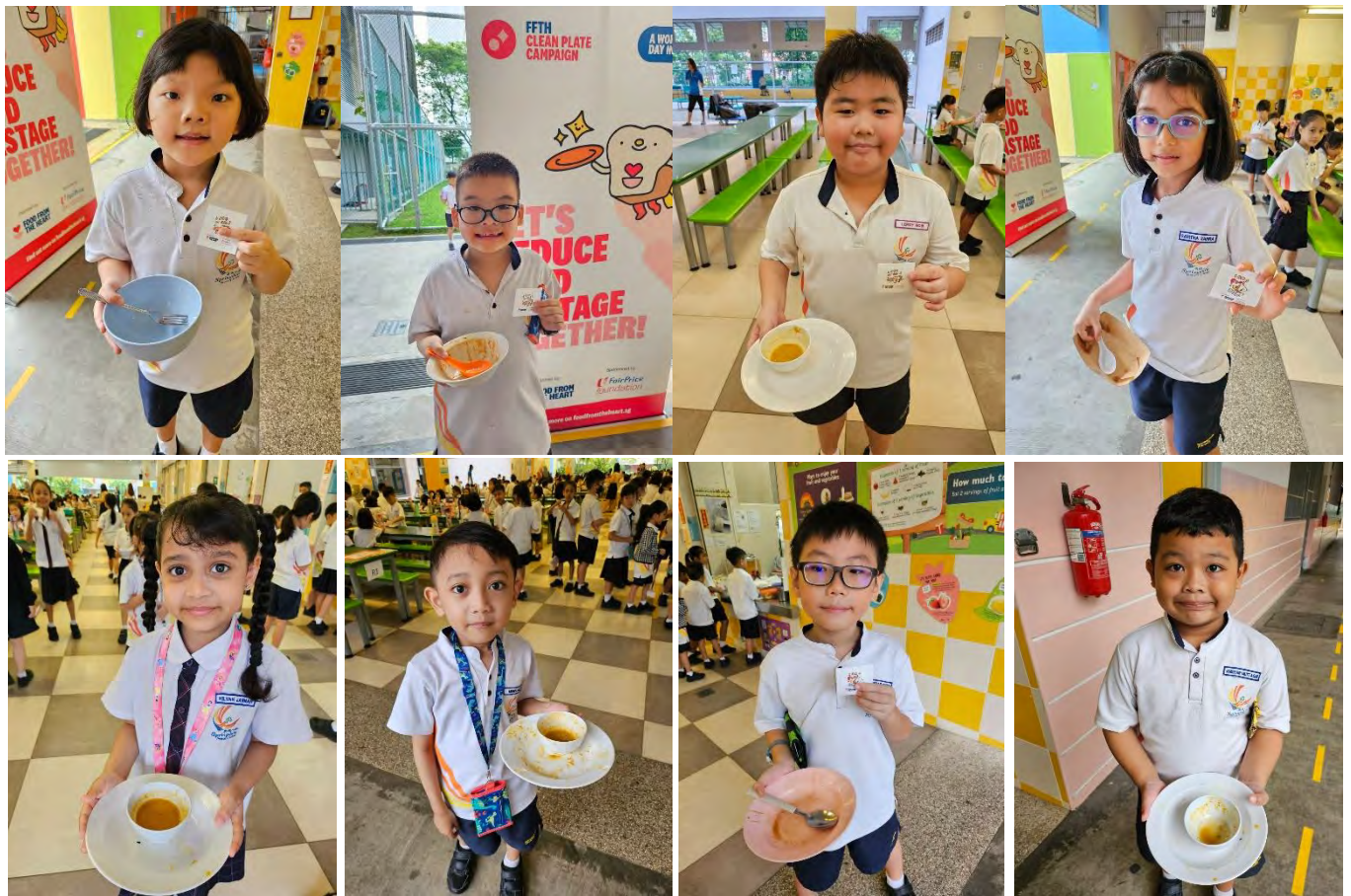
Springdalites with their clean plates.

For every clean plate, the students are also raising funds for the communities in need. This year, we managed to raise $4782 within 1 week! We hope that the students continue to appreciate the food that they have and reduce food wastage in school and at home.