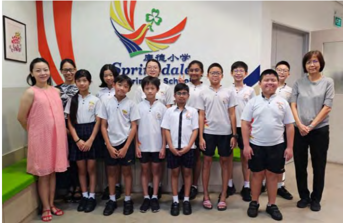
Our team of budding composers

We are thrilled to extend our warmest congratulations to 11 of our talented P6 Springdalites for attaining a Certificate of Participation at the SYF (Singapore Youth Festival) Youth Station Project. Their dedication and musical creativity have shone brightly. We are immensely proud of their accomplishments.