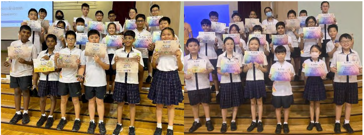
Primary 6 participants

This year, we achieved 2 Gold Medals, 4 Silver Medals and 11 Bronze Medals for SASMO; 2 Bronze Medals for APMOPS; and 3 Silver Medals and 2 Bronze Medals for NMOS. Congratulations to all our winners and participants who put in tremendous effort to prepare for these competitions.