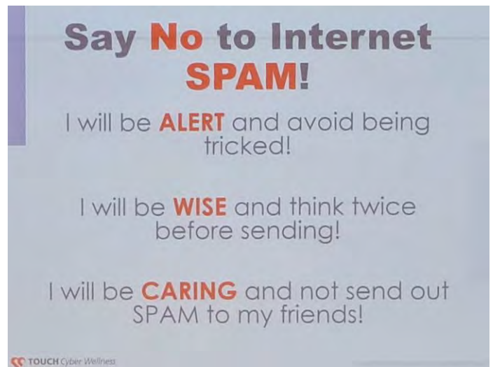
Presentation by guest speaker from TOUCH Cyber Wellness