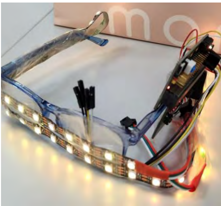
The Insight Navigator is a spectacle which the visually impaired individual wears to move around safely.