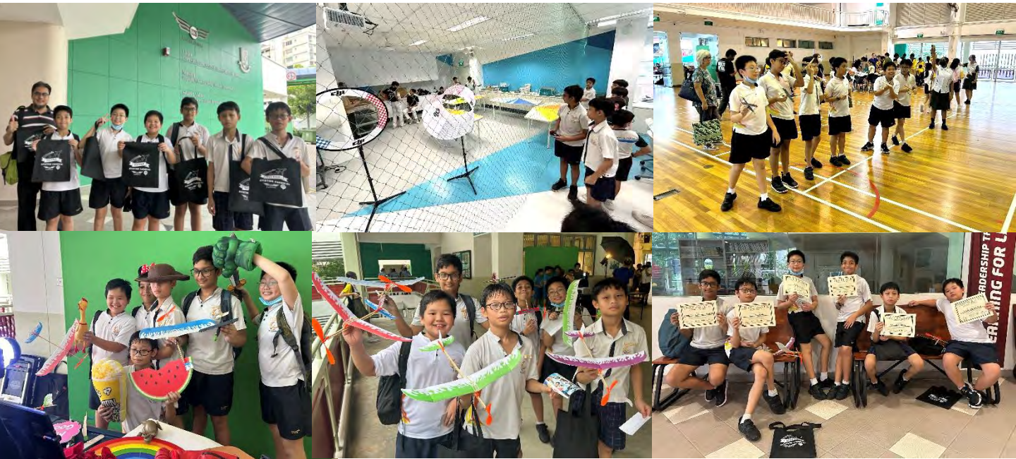
Participants of the Fly High Aviation Carnival at Changkat Changi Secondary School

During the carnival, our Springdalites had the opportunity to learn about various aspects of aviation through engaging workshops, including the various aspects of aircraft design, flight simulation and the future application of drones. They also participated in various hands-on activities, such as building and flying their own model aircraft and flying drones through obstacles.