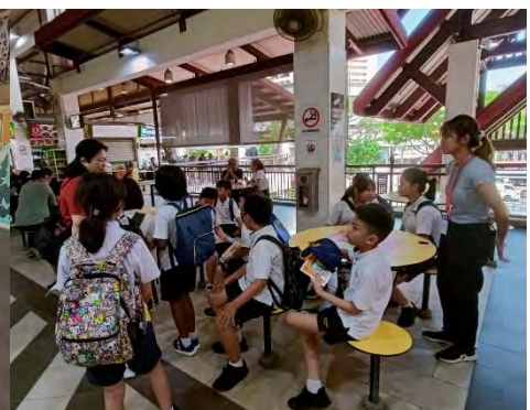
Students in action during the guided tour