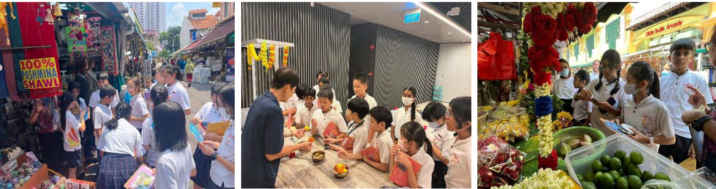
Students exploring the IHC galleries and Little India precinct

Students explored the permanent galleries at the Indian Heritage Centre and walked around the Little India precinct to observe the various trades and businesses which have been there for several generations. Overall, students had an insightful experience learning more about Singapore's multicultural heritage and history.