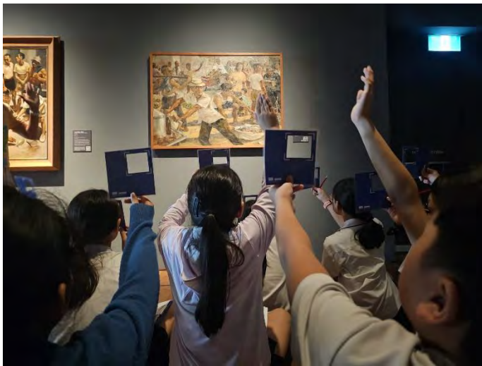
Students participating in art discussions about local artists and their artworks

The Primary 4 Art Museum-Based Learning (MBL) Programme at the National Gallery Singapore was an enriching core curriculum experience. Students explored local art and heritage in an authentic setting, guided by passionate facilitators who brought the exhibits to life.