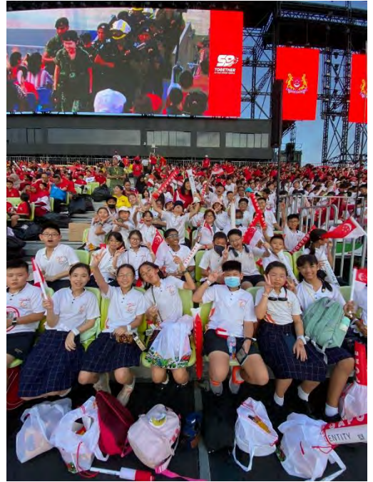
Watching the contingents marching onto the spectator stands

At the finale, they were fascinated by the spectacular fireworks while singing passionately to this year's theme song, "Not Alone". Through this NE show, our students realised the collective strength of Singaporeans standing together as one united people to honour our nation's progress and to express our love for Singapore!