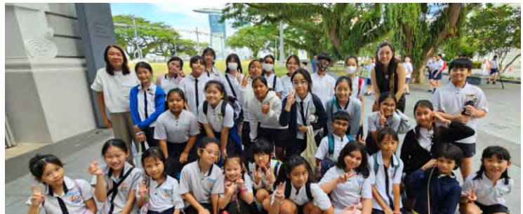
Springdalites and teachers were all smiles after watching the musical.