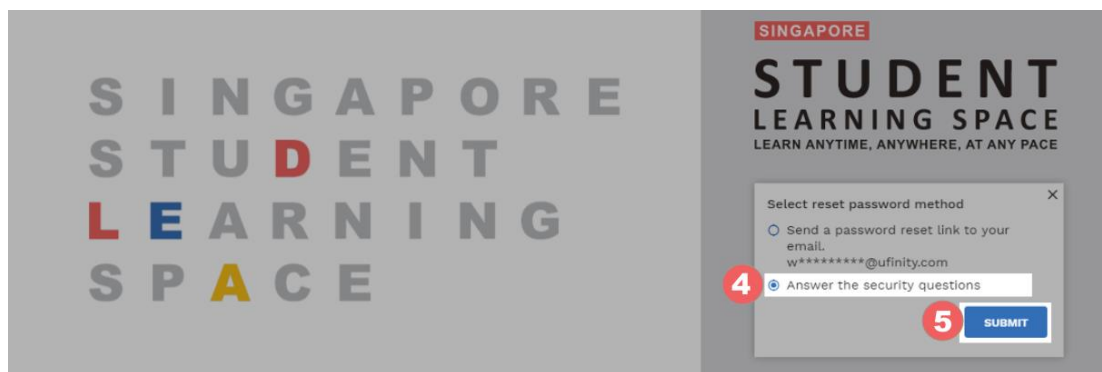
Fig. 2c: “Password Reset Link via Security Questions” Method