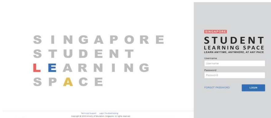
Fig. 1a: Login Page